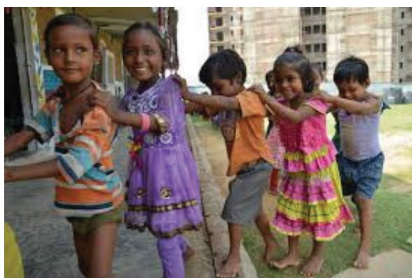
Figure 4. Young children holding each other's shoulders forming a train.

ten stones not less. If less, you still stay in the previous round of collecting ones, while others move to collecting twos.