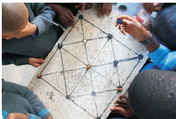
Figure 3. Young children playing with a board with squares and a die.