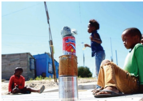
Figure 2. Young children playing with tins and a ball.

game uses small stones and can be played by a number of children taking turns; the smaller the group, the better. A circle is drawn on the ground where these stones are put in. The surface has to be smooth on the ground to be able to play. A player has to have one bigger stone, a spherical stone called “ingqanda” in his/her hand.