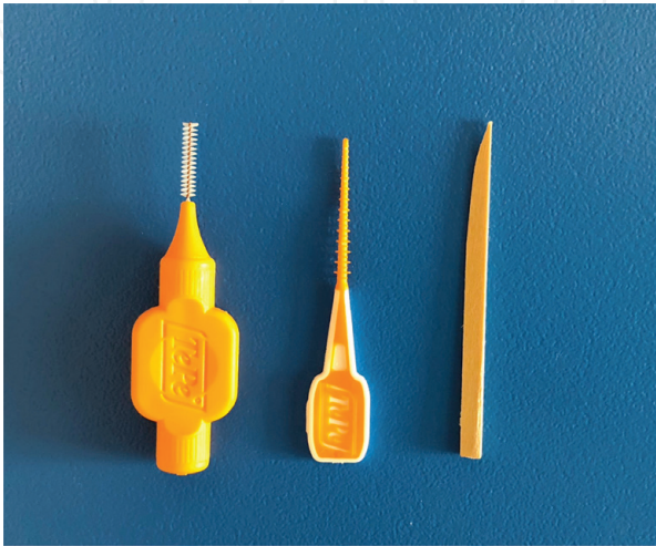
Figure 1. Interdental cleaning devices used in the study. From left to right; Interdental brush (TePe® 0.45), Rubber Interdental Bristle (Tepe Easypick™ XS/S), C) Woodsticks (TePe® Dental Stick Slim).

Due to the limited number of the published data regarding RIBs, a detailed systematic evaluation of these devices is yet impossible.