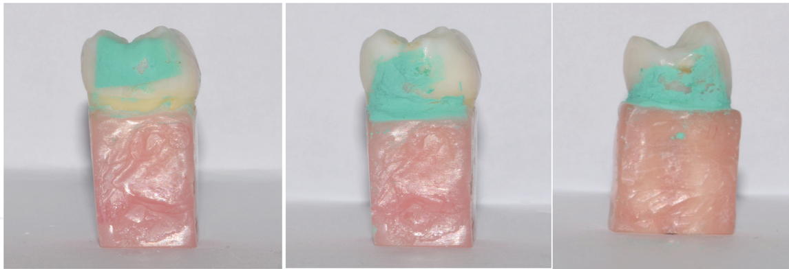
Figure 2. After application of the interdental cleaning devices. From left to right; Interdental brush, Rubber Interdental Bristle, Woodstick.