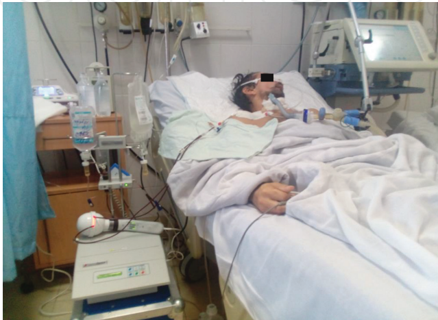
Figure 3. Patient T of 28 years old. The first session of plasma exchange on the device “Hemophenix” on the background of artificial lung ventilation, carried out for 2 weeks.