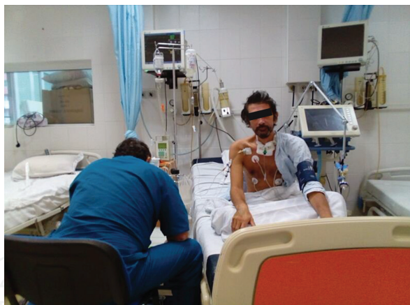
Figure 4. The same patient after two sessions of plasma exchange. Disconnected from the ventilator.

quite serious condition and was able to move only with someone's assistance. After the primary course of plasmapheresis, we followed the tactics of a “programmed” plasmapheresis once per month, which enabled him to return to his physical work of an auto mechanic. The follow-up period is 6 years.