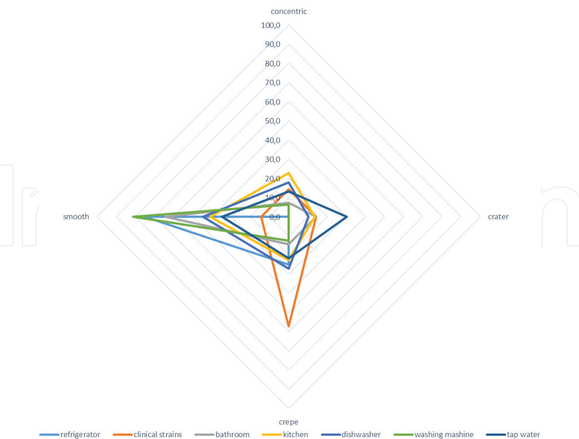
Figure 2. Prevalence of C. parapsilosis phenotype in indoor environments and among clinical isolates. Prevailing indoor phenotype of C. parapsilosis is the smooth one; crepe phenotype is a predominant phenotype in clinical isolates.

C. parapsilosis strains isolated from groundwater-derived tap water mostly formed smooth (34.8%) or crater (30.4%) phenotypes, followed by crepe (21.7%) and concentric (13.0%) phenotype. Tap water serves as a vector for fungi entering water-related niches in households [4], where environmental pressure leads to the selection of the most tolerant strains [17], even on the phenotypic level. Room interior and household appliances that are usually present in these rooms (bathroom and washing machine, kitchen and dishwasher) show similar phenotype distribution ( Figure 3 ). In addition, co-occurrence of different phenotypes from