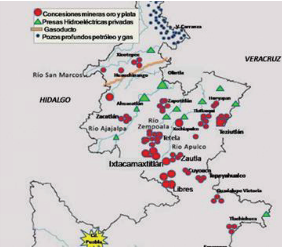
Figure 2. Map of municipalities of Puebla with concessions to companies.

favor of transnationals, it is necessary to consider the decisive participation of the state. As we mentioned above, it is an entity that supports one of the wildest forms of accumulation and reproduction of capitalism. We refer to a form of accumulation by forced dispossession that, in areas where the territory is vital for the social reproduction of the community, is legitimized by the state.