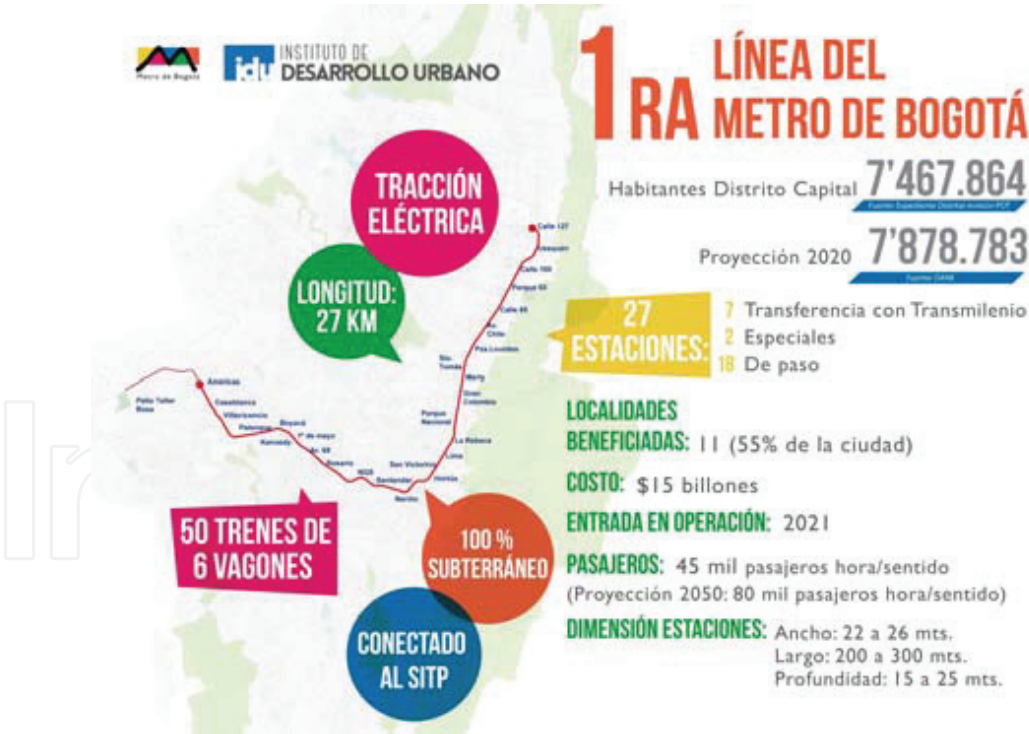
Figure 3. First subway line in Bogotá 2012 [5].

The Metro proposed by Enrique Peñaloza is cheaper and faster to build because it just requires adequation and rehabilitation of the public space around the stations. It does not need a recollection water system, the investment on other systems of the infrastructure like