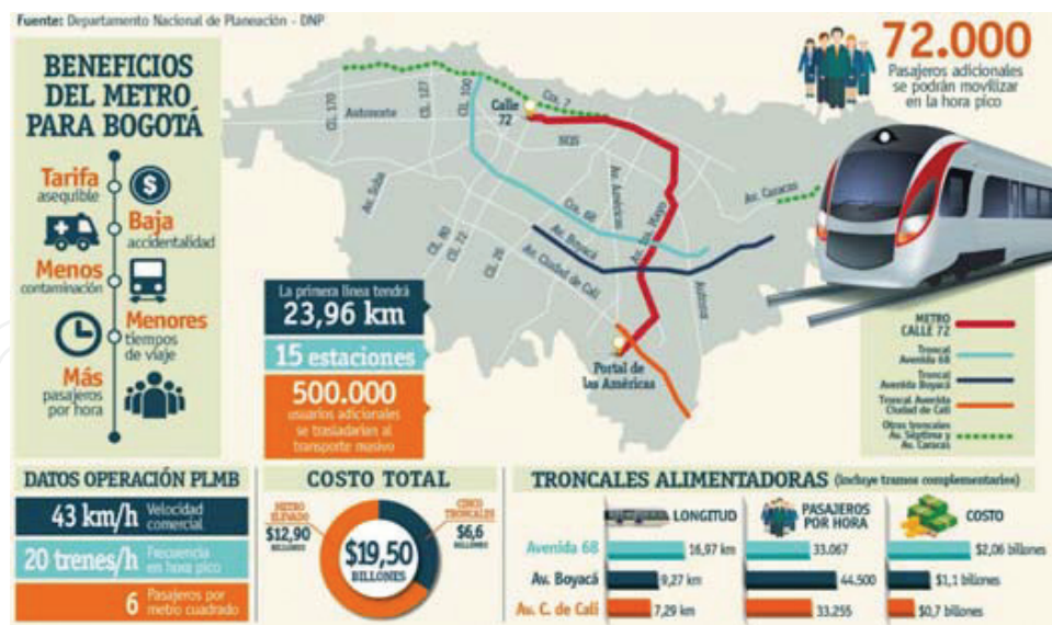
Figure 4. Bogotá Metro 2016. Bogotá Subway 2016. ( http://www.vanguardia.com/politica/410725-la-nacion-solo-aportara-909-billones-para-el-metro-de-bogota ). Image that shows that the line is shorter and there is only connectivity of the Metro with the lines of TransMilenio projected to be developed also in the current period of government.

energy, expansion of the aqueduct and sewerage networks, the participation of the people, nor plans to integrate city systems and the city with the towns around the first ring. The model proposed in a private-public association consists in creating the financial conditions to build the Metro, which is going to be financed by the private recourses, allowing these investors to grow in altitude their buildings, choosing the best locations and getting the benefits of the greatest value involved in the urban interventions.