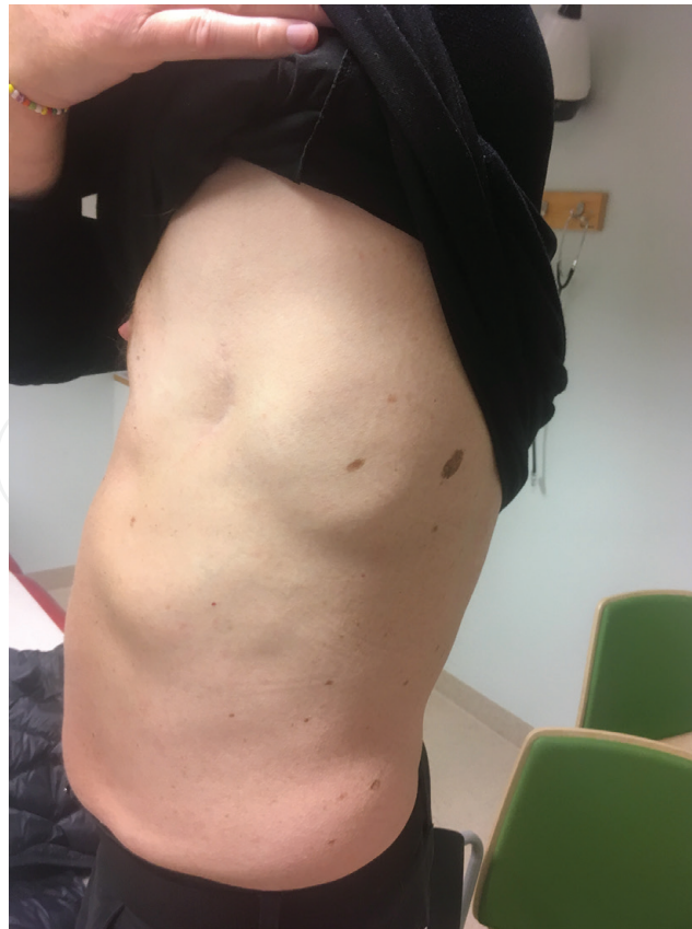
Figure 2. Lateral view of a patient with an implanted S-ICD. (Courtesy of Dr. Peter Magnusson with permission of patient.).