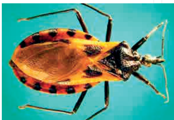
Figure 3. Triatoma dimidiata [25].

Mexico is located in both the neotropical and Nearctic regions, having different demography, climates and vegetation, with over 19 vector species, Yucatan has the Triatoma dimidiata as its most abundant and epidemiologically relevant vector ( Figure 3 ), although other triatomines are present and sporadically collected even in anthropic habitats: Panstrongylus rufotuberculatus , Eratyrus cuspidatus , Triatoma nitida , Triatoma hegneri with 88% of the population exposed to at least one of this competent vector species [31].