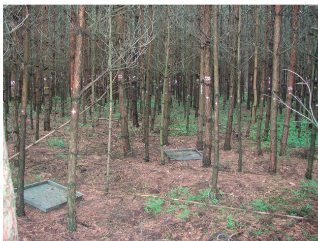
Figure 3. Litter fall collectors in young Scots pine stands.