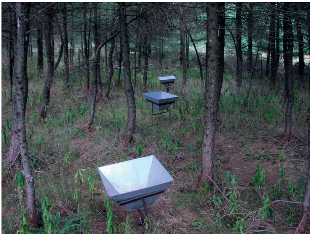
Figure 5. Litter fall collectors in young European larch stands.