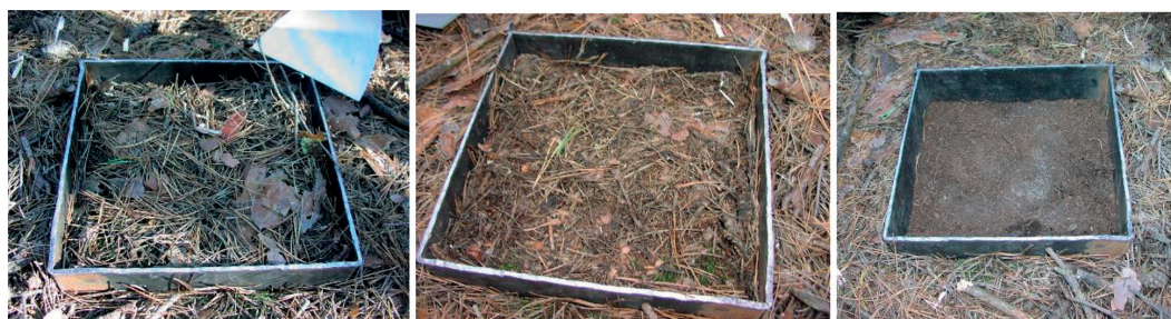
Figure 2. Sampling of forest floor under Scots pine stands—horizons L—litter (left), F—fermentation (in the middle) and H—humus (right).