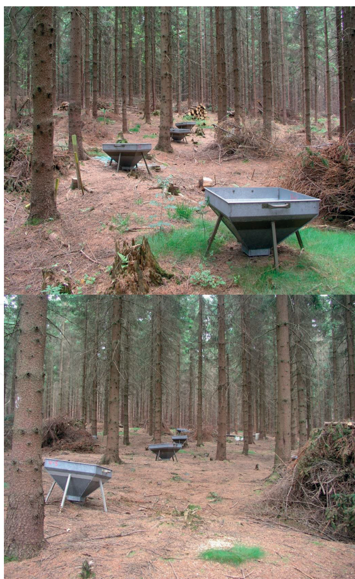
Figure 4. Litter fall collectors under control (above) and thinned (below) Norway spruce stands.