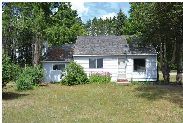
Figure 9. An image of a modest rural residential setting collected in the study area with a score of 46.6.

The map resulting for this study is an image representing the spatial perceptions of the respondents concerning the quality of the landscape across the state. As the land is managed and developed, the scores can be recomputed to estimate the perceived changes (both improvements and degradation) for the state. With additional research, the map could be considered a metric of the state's general perceived environmental quality. Across the globe, people are concerned about the impacts of human's transforming the environment; yet, comparatively, the compiled total environmental quality has not appreciatively changed since the arrival of Europeans, Africans, and Asians (a score predicted to be around 43 between the years 1816 and 1858 to a score of 47.4 in the year 2001, which is not significantly different in perceived quality) [40]. Figures 9–11 are images from the landscape with scores near the current expected mean for much of the state. Notice none of the images are spectacular; however, none of the images age dismal either.