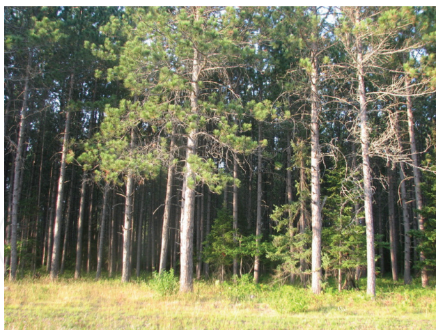
Figure 2. Image of sample number 67 of a forested landscape in the upper peninsula of Michigan (visual score of 38.548).