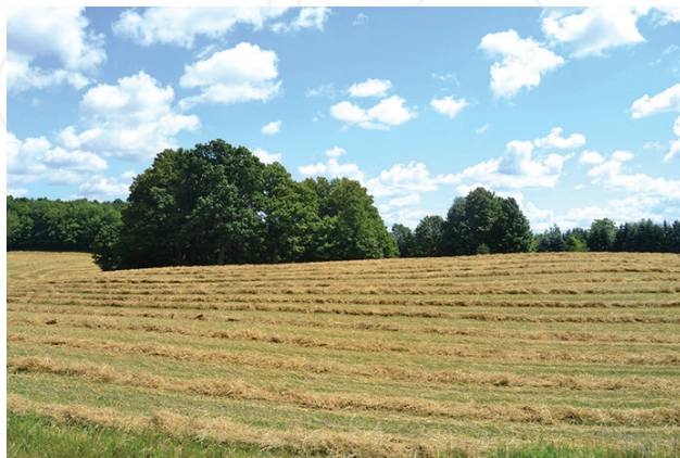
Figure 10. An image of a typical agricultural landscape found in much of Michigan. This image produced a score of 44.1.