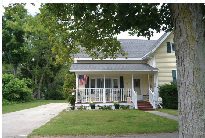
Figure 4. An image of a residential landscape (urban savanna with visual quality score of 46.587), sample number 12 in the northwest of the lower peninsula.