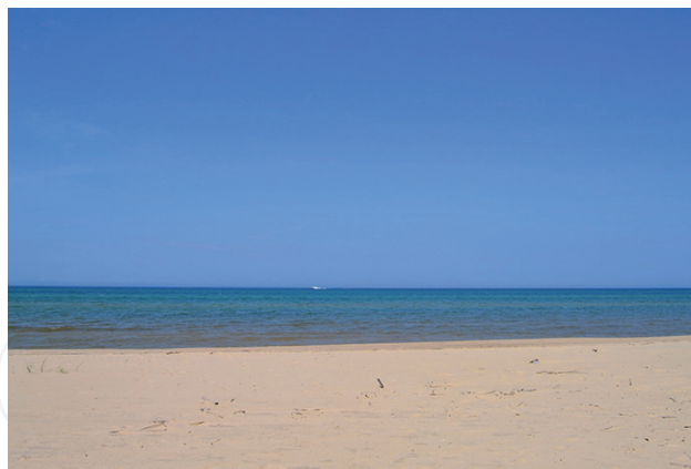
Figure 11. An image of a great lakes coastline, generating a score of 47.8.

The results of this study and related studies indicate that land cover type is a strong predictor of visual/environmental quality. In planning and design circles, the nuances of the built environment are heavily debated with small details carefully examined by experts. Yet respondents evaluate these cover types relatively uniformly. In other words the refined changes and differences observed by experts and taught in planning and design schools are not necessarily observed/detected by the public. For experts the differences between communities can be quite distinct. As Charles Jencks indicated, there are at least two levels of cognition: the expert's and the public's [41]. For example, architects debate the merits of buildings; however, the research suggests that a poor building in a warehouse district or a noted piece of architecture such as Frank Lloyd Wright's Falling water house are perceived as simply structures and the less of them comprising the view, the more the environment is preferred [23].