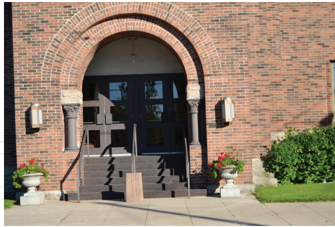
Figure 5. An image of sample number 73 of a downtown environment (cliff detritus with a visual score of 82.766).