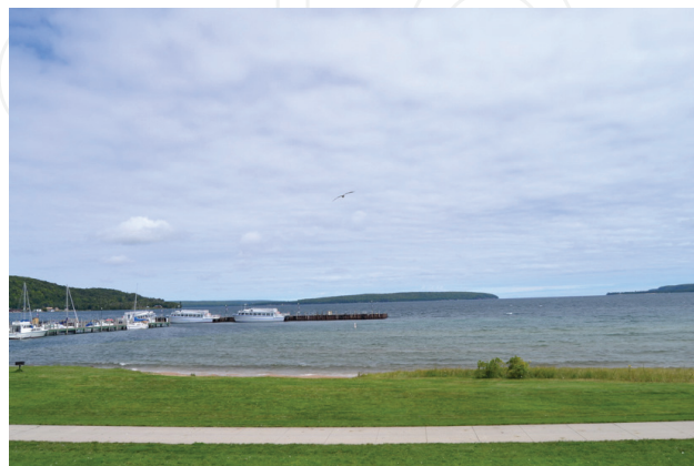
Figure 7. An image of sample number 46 of a primarily open water environment of Lake superior (with a visual score of 41.498).