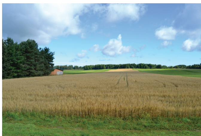
Figure 3. Image of sample number 80 of a farmland landscape in north-east of the lower peninsula of Michigan (visual score of 44.09).