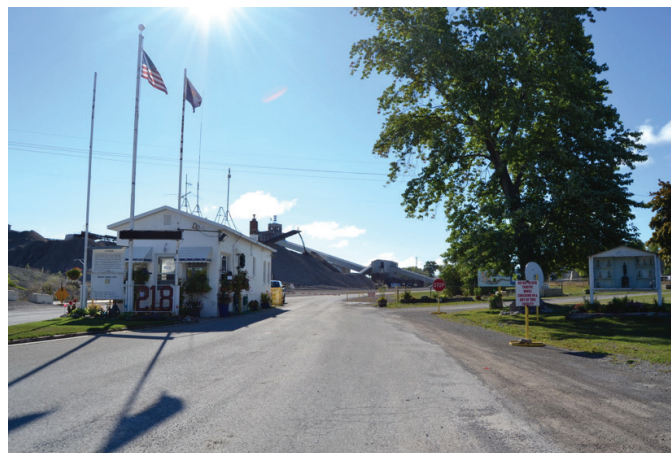
Figure 6. An image of sample number 77 of an industrial environmental (with a visual score of 78.778).