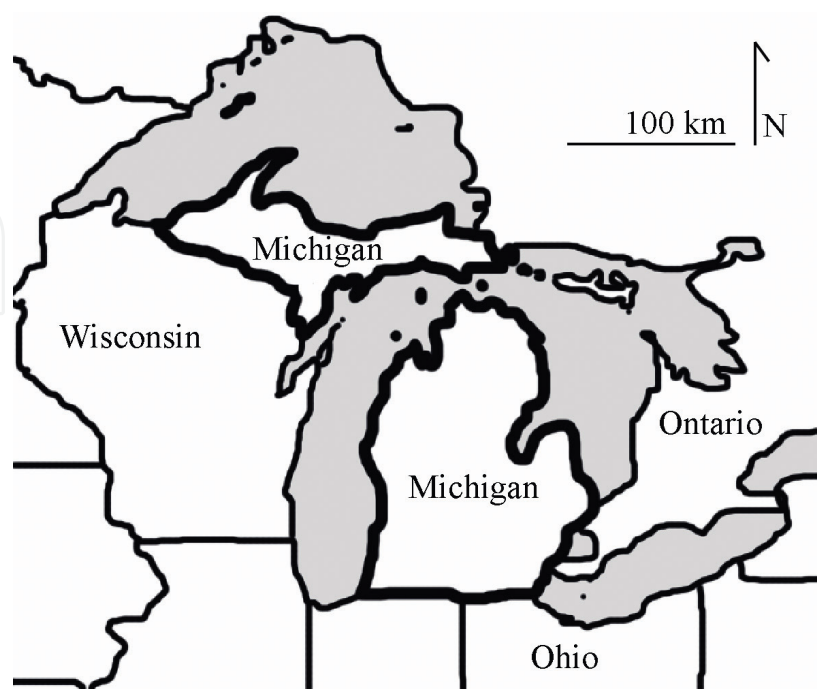
Figure 1. The location of Michigan, the study area in North America.

Also during this recent timeframe, attempts to explore mapping making potential were renewed. Lu et al. examined the Lower Muskegon watershed, located on the west side of the lower peninsula in Michigan [26]. He and his colleagues studied images of urban areas, farmland, wetlands, and forests and attempted to construct an environmental quality map of his study area. The results he obtained through statistical analysis revealed that the relationship between his predictions in the map and the real photographs are in concordance and at a reasonable (95%) confidence level. He concluded that visual/environmental quality could be mapped and reliably predicted in the Lower Muskegon Watershed. There was a strong relationship between the perception of environmental quality and land cover. Following Lu, Jin examined the southern portion of Michigan, an area much larger than the Lower Muskegon Watershed [27]. She reported similar results to Lu. She had demonstrated that it was possible to develop reliable maps for much larger areas, but still not at the scale of a province or state.