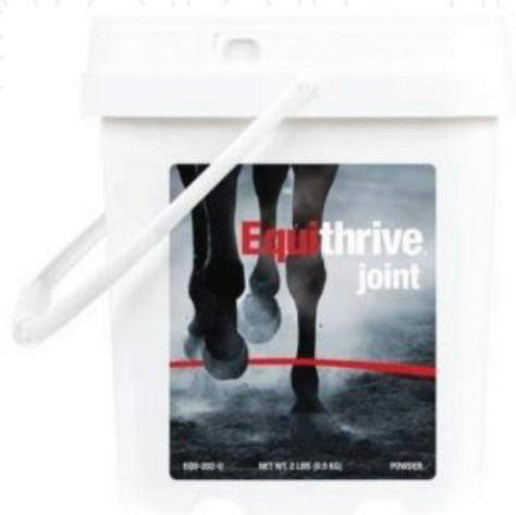
Figure 3. Equithrive®: a horse supplement, containing resveratrol and hyaluronic acid [81].

Studies by Ememe et al. [82], showed a significant reduction in values of creatine kinase and glucose in the horses administered resveratrol and hyaluronic acid (equithrive joint®) (Figure 3) supplement. Elevated levels of these substances have been associated with a reduction in metabolic efficiency in aging animals. Hence, administration of equithrive joint® may help to reduce the harmful effects of these biochemical parameters during aging in horses. Also a study on horses exhibiting hind-limb lameness and poor performance was carried out with equithrive joint®. The researchers injected each horse's lower jock joints with triamcinolone before supplementing with equithrive joint® for 4 months [83]. The result showed higher percentage of riders who reported better performance of their horses. Ememe et al. [84] also reported that administration of equithrive joint to aged and lame horses decreased the serum MDA concentration and modulated the serum content of GPx, catalase, and SOD. The results suggested a potential protective effect of equithrive joint against oxidative stress and aging in