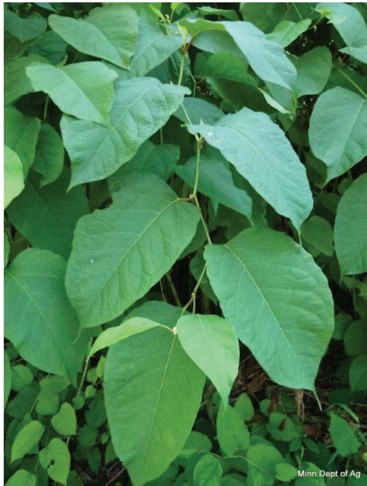
Figure 2. Japanese knotweed, a well-known rich source for resveratrol [8].

Khan et al. [19] and Sahin et al. [20], stated that resveratrol increases regulation of antioxidant enzyme like catalase (CAT), superoxide dismutase (SOD) and glutathione peroxidase (GSH-Px). This result in reduction of oxidative stress and attenuation of inflammation, and these mechanisms may account for many of its health benefits. The antioxidant activity of resveratrol may also inhibit oxidation of low-density lipoproteins (LDL), and therefore, decrease endothelial damage associated with cardiovascular disease [21, 22].