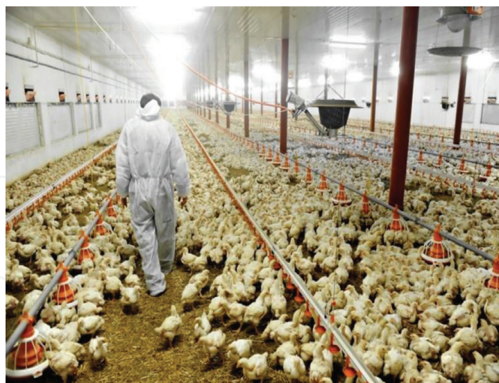
Figure 6. Resveratrol administered as a feed additive to control aflatoxicosis in broilers [92].

Xu et al. [94] observed that resveratrol ( 3.85 \mu\text{g mL}^{-1} ) supplementation decreased duck enteritis virus multiplication by 50%. This may be due to the inhibition of viral proliferation in the host cell.