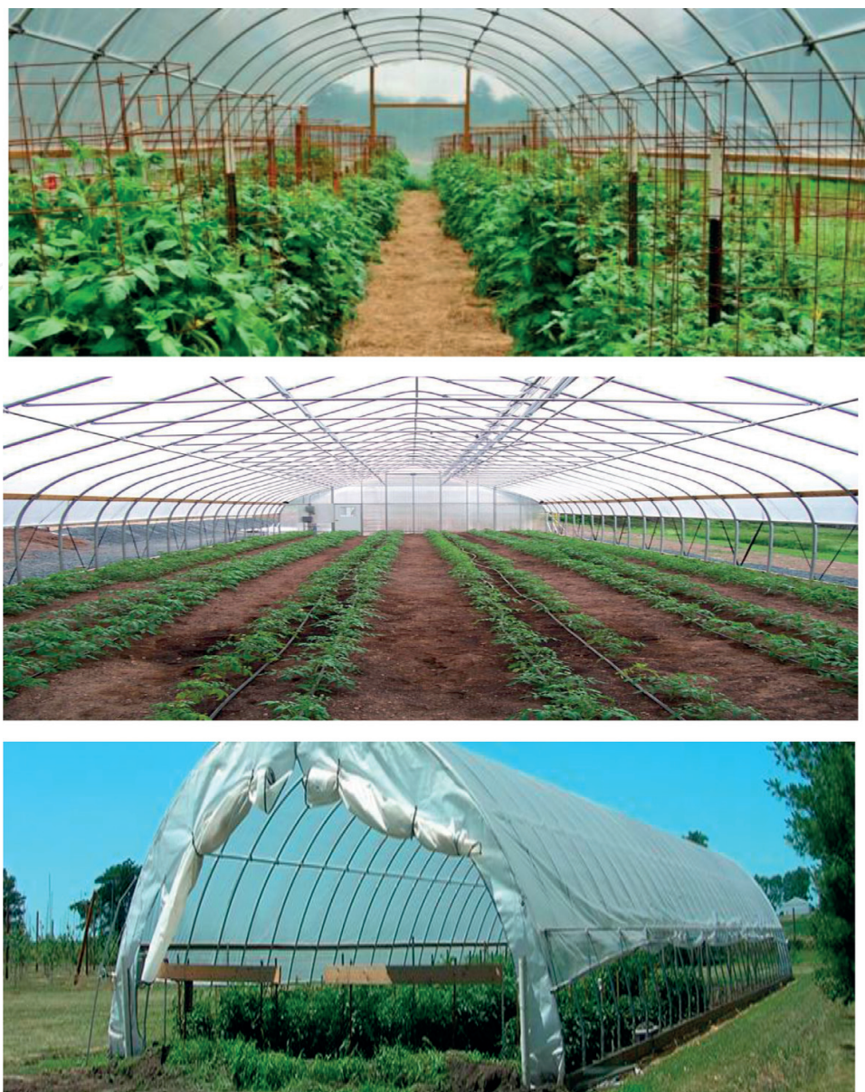
Figure 1. Interior and exterior features of high tunnels for controlled vegetable cultivation.

system which supplies water at low tension and high frequency to create optimum environment for growth of the vegetable [41, 42]. By avoiding soil medium, the use of hydroponics enables the grower to prevent diseases and soil-borne pests, such as nematodes, that are difficult to control [43]. Tomato production under protected systems such as hydroponics allows cultivation in regions inappropriate for conventional agriculture by efficiently using natural resources particularly water and soil [44]. Hydroponic systems provide regulation of harvesting, avoiding crop rotation, better fruit quality, better crop handling, and better control over nutritional needs and environmental conditions. Growing tomatoes under hydroponic system allows the grower to raise them under a controlled environment with less chance of disease, faster growth, and greater fruit yield. This offers several advantages in terms of the quantity and quality of products obtained per unit land area over cultivation in soil [45].