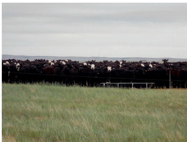
Figure 1. A mob grazing herd waiting for the next pasture.