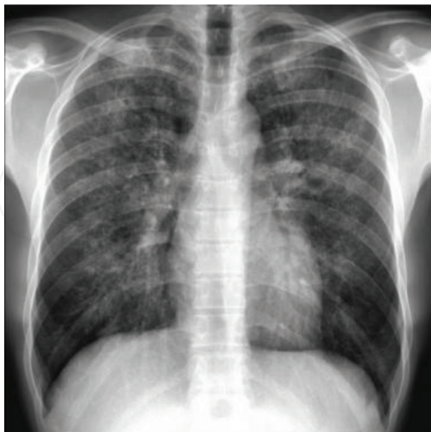
Figure 1. Chest radiography in a patient with absolute neutrophil count <0.1 \times 10^9/L : “Masked” pneumonia.

However, besides these “loud” clinical manifestations, clinicians must keep in mind that the signs of these infections may be sometimes crude and atypical because of the neutropenia ( Figure 1 ). For practitioners, it is to note that pneumonia is often asymptomatic because of the lack of neutrophil cells. In this situation, thoracic CT-scan may be proposed with much better results than X-ray ( Figure 2 ). Similarly, when antibiotics are administered prophylactically, or at the beginning of this adverse event, both the patient’s complaints and the physical findings may be “masked,” and fever is often the only clinical sign detected [2].