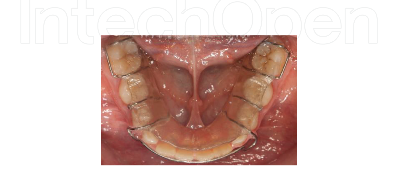
Figure 2. Acrylic removable appliances.

On the contrary, other authors [12, 13] reported the undesired effects of removable appliances on tooth enamel. Batoni et al. [14] reported a higher amount of S. mutans in children using removable appliances. Considering the acrylic removable appliances; there may be plaque accumulation and even calculus on the unpolished acrylic surfaces, especially in noncompliant patients. Acrylic structure of them may influence the proliferation of microorganisms when it acts as a food deposit. Depending on its smoothness and size, it may provide plaque accumulation that leads to enamel decalcification [9, 12, 14]. Addy et al. [15] showed that palatal plaque scores were significantly higher in wearers of removable appliances compared with a control group without orthodontic treatment. As these appliances mainly cover the lingual/palatal surfaces of the teeth, plaque occurrence in that region tend to be higher than other sides.