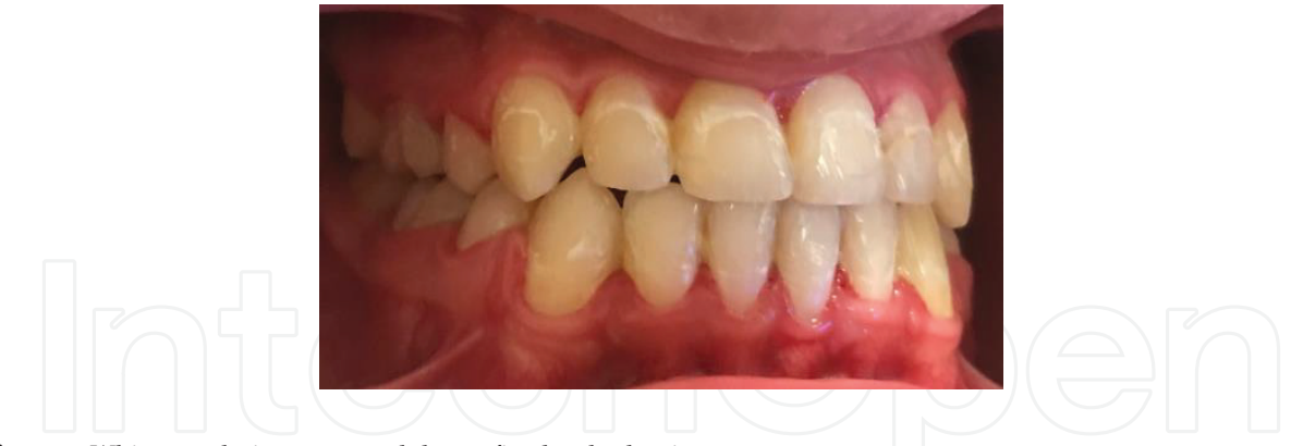
Figure 5. White spot lesions occurred due to fixed orthodontic treatment.