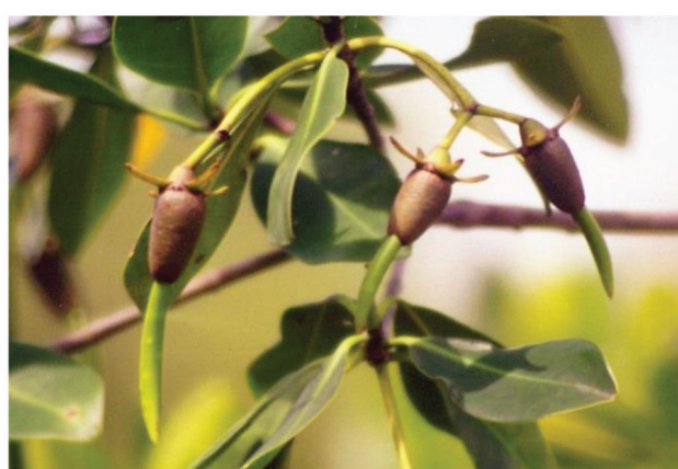
Flowers and propagules of Rhizophora mangle.