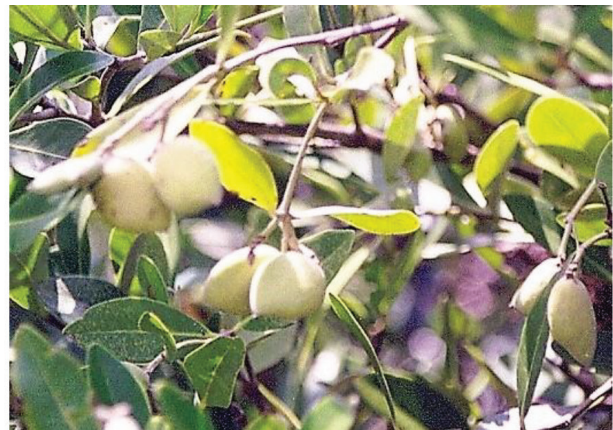
Flowers and propagules of Avicennia germinans.