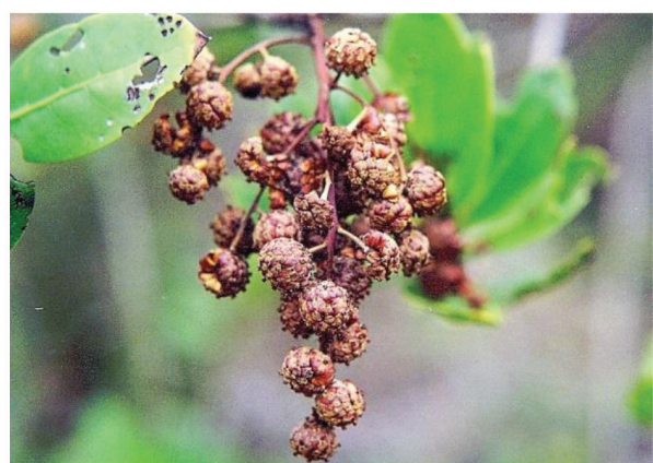
Flowers and fruits of Conocarpus erectus.