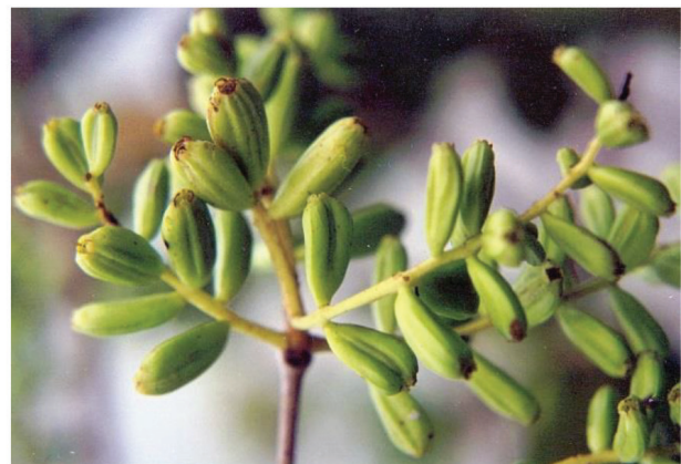
Flowers and propagules of Laguncularia racemosa.