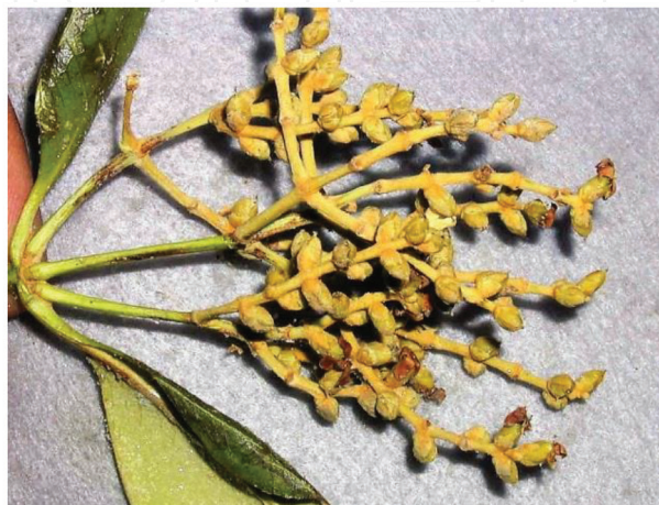
Flowers and propagules of Avicennia bicolor . Cistian Tovilla Hernández. Diplomado Internacional en ecología, manejo, restauración y legislación en sistemas de manglares (2017). ECOSUR.