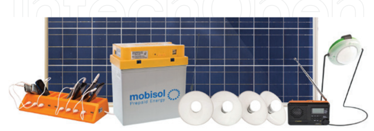
Figure 1. A 100 W solar home system with kit of DC appliances from Mobisol.

The foregoing discussion illustrates that widespread electricity access is achievable as demonstrated by the two countries, Seychelles and Mauritius, with 100% electricity access; it also points to the complexities associated with tackling the problem of electricity access; for instance, three countries have less than 10% access and 50 of the 70 countries recorded have less than 50% access.