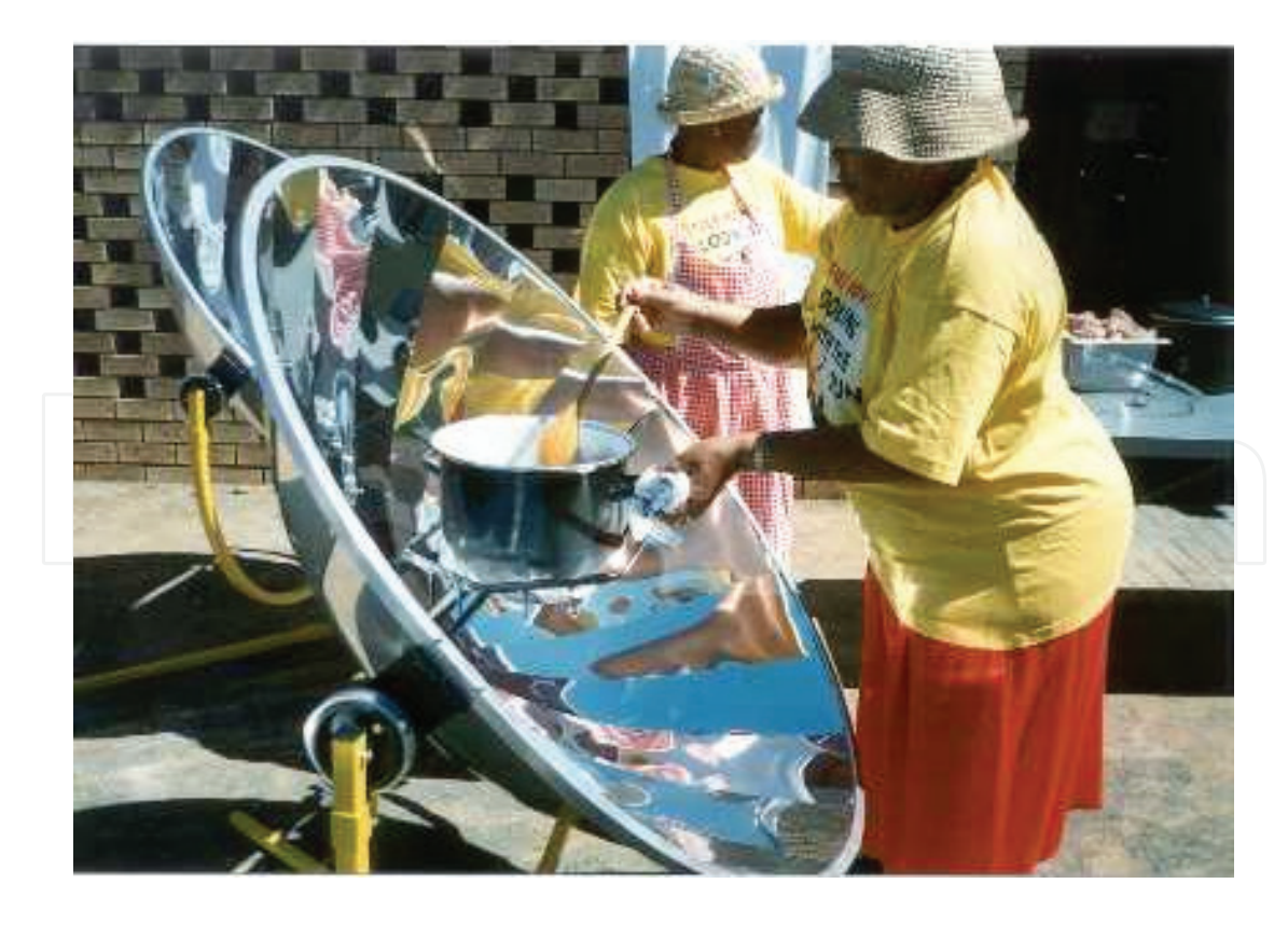
Figure 5. Preparing meals using SK12-Improved version of SK14 Kimberley-South Africa 27-27 November 2000.