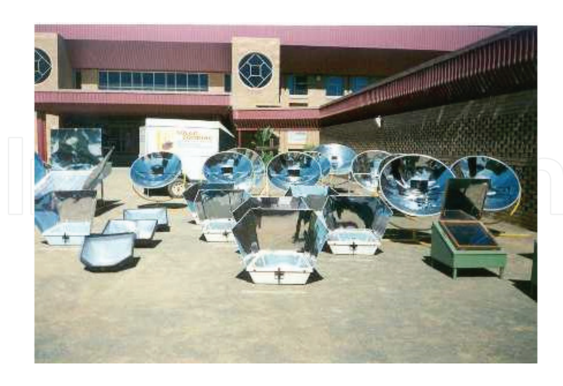
Figure 4. A collection of solar cookers at international conference on solar cooking, Kimberley-South Africa 27-27 November 2000.