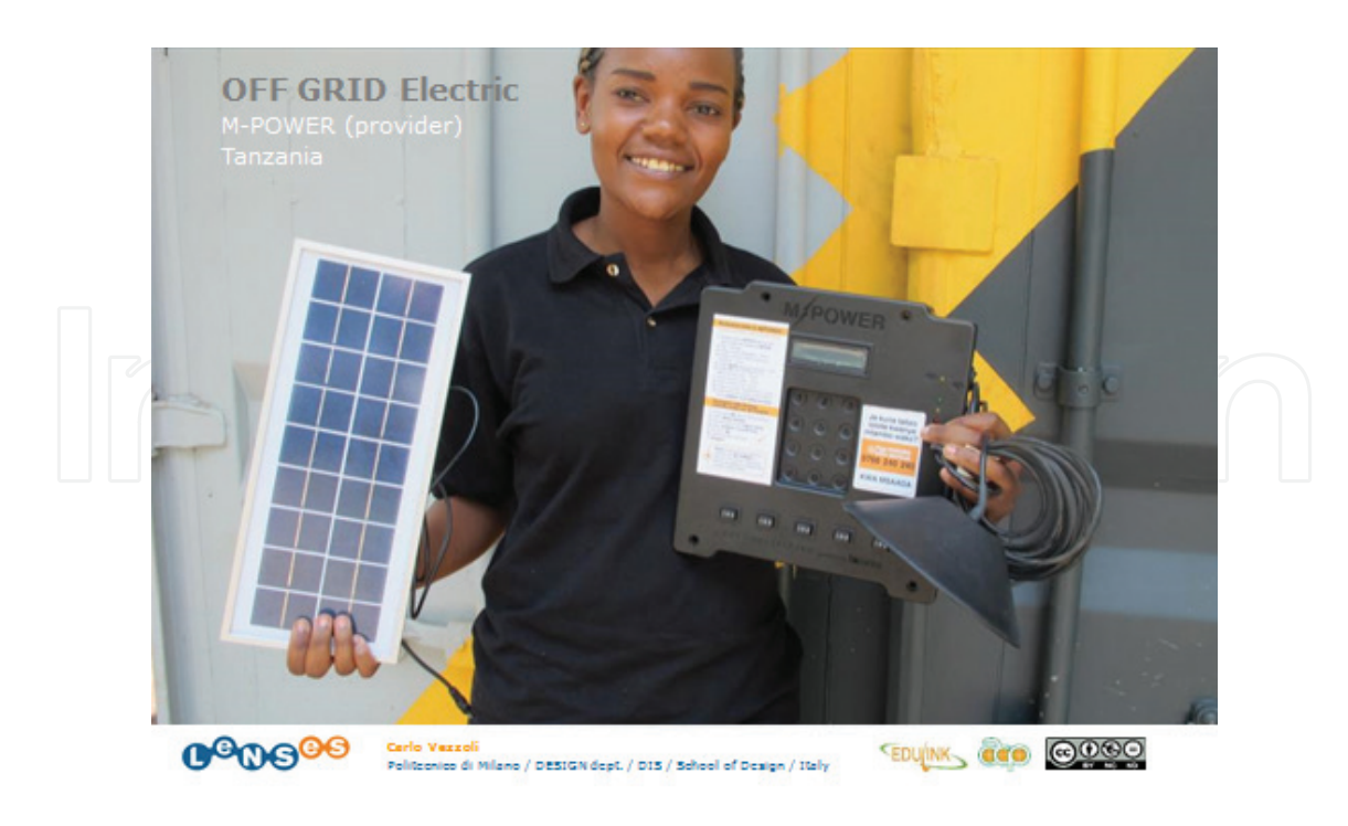
Figure 2. A client showing an M-power solar product based on a 'pay-per-period' concept.

It is also noted that several countries are taking measures to deal with the problem of electricity access. Some of these measures include market liberalisation and development of appropriate legislations. Other initiatives are the promotion of sub-regional integration and development of innovative financing capital and client flexible repayment schemes.