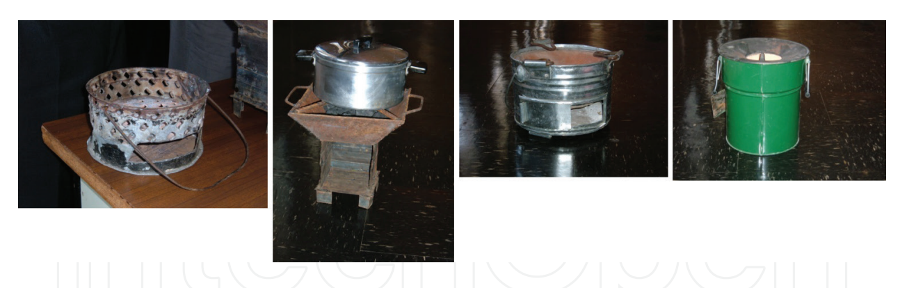
Figure 3. Pictures of combustors on exhibit at inaugural PEN workshop 2009.