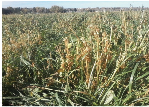
Figure 2. Early symptoms of frost damage to alfalfa in a mixture with meadow brome grass and birdsfoot trefoil. The other crops seem not to have been affected by the frost. The photo was taken on October 21, 2016 at the University of Wyoming Sheridan Research and Extension Center, Wyoming, USA.

Extensive damage triggers loss of plant's photosynthetic surface, which impairs tiller development and plant growth. Figure 2 shows early signs of frost injury to alfalfa growing in a mixture with meadow brome grass ( Bromus biebersteinii ; Roem & Schult) and birdsfoot trefoil. It is evident that meadow brome grass and birdsfoot trefoil have not been affected by the frost. This attests to the varying abilities among grass and legume species to tolerate excessively cold temperatures. On the other hand, winter hardiness is dependent upon hardened plant tissues and reduced leaf growth in fall. To sum up, species persistence is determined by genetic and physiological traits that enable species to acclimate to less ideal environments in multiple cropping systems.