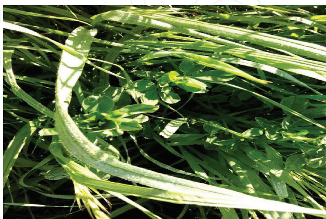
Figure 3. Meadow brome grass with elongated leaf sheaths and blades representing shade avoidance when grown in mixture with alfalfa at the University of Wyoming Sheridan Research and Extension Center, Wyoming, USA.

Nitrogen fixation is also adversely affected by shading. It has been demonstrated that legumes shaded by grass have reduced size of nodules [16]. This impairs their ability to fix N. However,