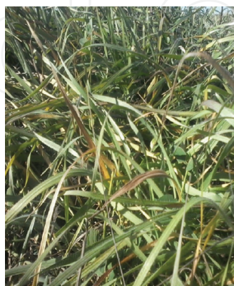
Figure 1. Poor growth of sainfoin in mixture with meadow brome grass after second harvest in August, 2016. The photo was taken on October 21, 2016, at the University of Wyoming Sheridan Research and Extension Center, Wyoming, USA.

Cold temperatures are particularly detrimental to legumes. Winter injury includes intra and intercellular freezing of unhardened plant tissues and physical damage to roots caused by ice heaving [7]. Plants exposed to freezing temperatures may also indirectly suffer from dehydration when water in plant tissues is bound in ice [8]. Frost damage causes intracellular freezing.