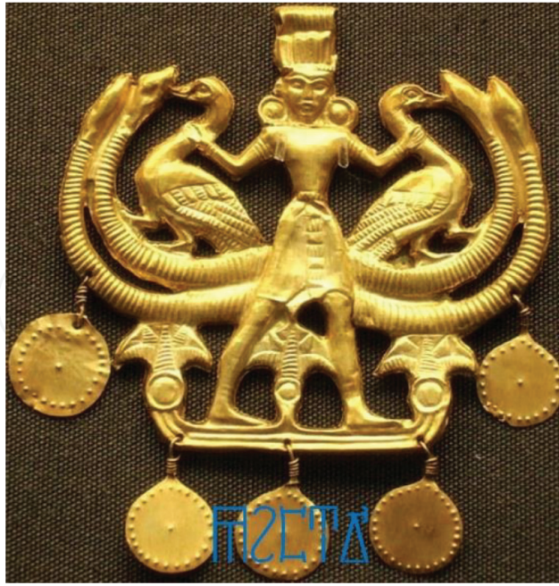
Figure 1. Laconic/Minoan mother of drones >1900 BC (Aegina) (British Museum, London).