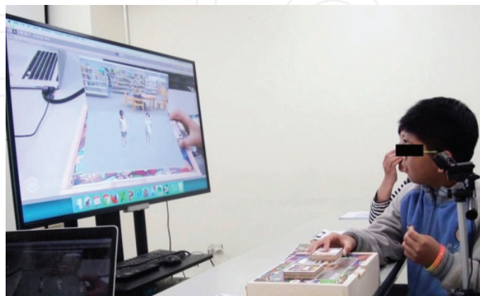
Figure 1. The therapist taught the children how to use the AR-RPG system and how to manipulate the cardboard avatar to observe and pretend (role play) the avatar’s situation.