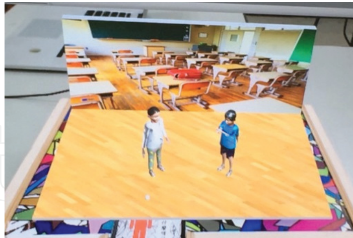
Figure 2. Different scenes with corresponding scenario events (classroom and playground in the community).

daily experience: (e.g., greeting parents, greeting friends, and greeting strangers). Those scenes are useful for children with ASD to be trained while pretending to make appropriate responses to greetings. In addition, we focus on teaching the six types of greeting behaviors of social etiquette, including (1) nodded head and tiny smile, (2) handshakes, (3) waved hand and said hello, (4) kisses their head or face, (5) hugs, and (6) shrug your shoulders; this greeting is often seen in Taiwan's daily life and also useful to train children with ASD social interaction skill. Beyond the greeting, which may involve a verbal acknowledgment and sometimes a facial expression, gestures, body language, and eye contact can all signal what type of greeting is expected. Therefore, we also add the social story and dialog contents with text description within our greeting scenario, to let the specific greeting behavior situation present more closely to the real status.