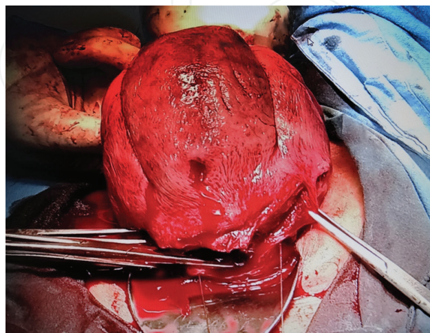
Figure 2. B-lynch technique.

If all the above is not enough to stop the hemorrhage, then the indication to carry out a hysterectomy appears, which can be performed subtotally given the haste and critical conditions in which most of the patients are, as well as being a surgery which implies greater difficulty due mainly to the vascular changes that arise with pregnancy. With this procedure, if there are