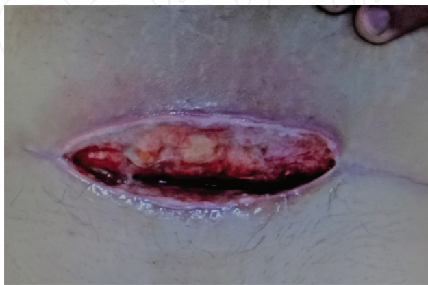
Figure 4. Transverse abdominal infected wound.

The incision in the abdominal wall acquires a great importance in the presence of complications since the transverse incisions restrict the surgical field in such a way that the vertical