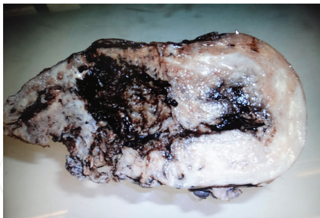
Figure 1. Placenta accreta invading the uterine muscle layer.

adequate contraction of the uterus, and if it is not achieved, it must be started with the administration of the following substances to contract the uterus [3, 4, 14–18, 22–24]: