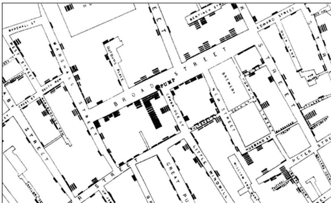
Figure 1. Original map by Dr. John Snow illustrating clustering of cholera cases in the London epidemic of 1854. Cholera cases are highlighted as black lines [7].

Mesothelioma is a rare but aggressive cancer that arises in the mesothelium, the lining of the pleura, peritoneum, and pericardium. Studying the prevalence of mesotheliomas in asbestos miners of South Africa established asbestos exposure as a critical factor responsible for this deadly malignancy. In a study by Wagner and colleagues, it was noted that while mesothelioma is a very rare disease in the Northwest Cape province of South Africa, 33 cases were described in the area, each having occupational exposure to crocidolite asbestos mining [8]. This finding was shortly followed by several population studies in Quebec Canada, United Kingdom, The Netherlands, Germany, Scotland and Northern Ireland, demonstrating that