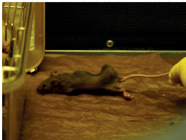
Figure 2. 20 weeks old male CNPcol2a1TG mice with kyphosis and excess growth of longitudinal and vertebral bones.

Transgenic mice that overexpress CNP ( CNPcol2a1TG ) in cartilage develop skeletal overgrowth and increased bone density: in order to further study the effects of CNP in skeletal growth and bone architecture in vivo, we generated transgenic mice by cloning human CNP cDNA (450 bp) into a construct that contained mouse collagen type II ( Col2a1 ) promoter (GenBank #m65161) to specifically overexpress CNP in chondrocytes. Growth plates of CNPcol2a1TG mice showed increased numbers of proliferative chondrocytes measured by BrdU uptake ( p < 0.05 ) and increased numbers of enlarged hypertrophic chondrocytes