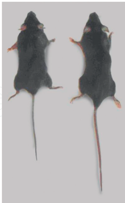
Figure 3. CNPcol2a1TG mice (on the right) are tall and slender as compared to the wild type littermates (on the left).

CNP was first isolated from porcine brain and was expected to be a neuropeptide [73], but the physiological significance of the CNP/GC-B system has been established in the vascular and skeletal systems [53, 58, 71, 72, 74–78]. It was reported that CNP and GC-B are expressed in the central [79–83] and peripheral nervous systems [84, 85]. It has been shown that the hypothalamus is an important center to control food intake and energy expenditure [86]. CNP mRNA was detected in the rat hypothalamus indicating this peptide's role in numerous