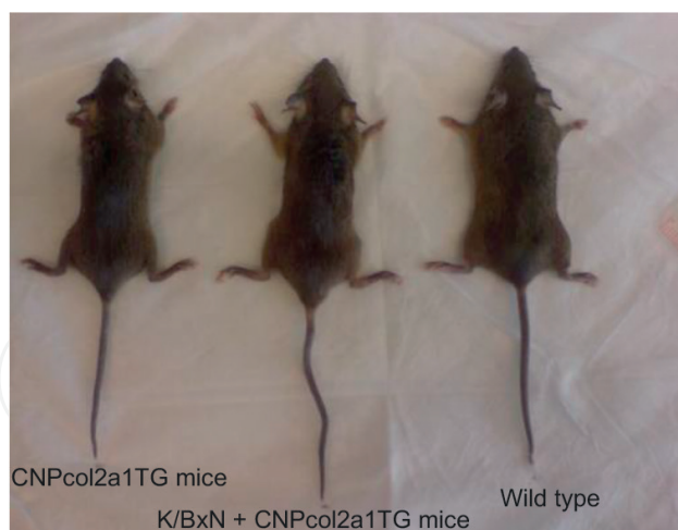
Figure 4. K/BxN+CNPcol2a1TG double transgenic mice do not develop growth retardation or severe complications of arthritis.

effectively attenuates lipopolysaccharide (LPS)-induced endothelial activation by eliminating intracellular ROS production, inhibiting the NF- \kappa B and MAPK p38 signaling pathways and activating the PI3 K/Akt/HO-1 pathway in human umbilical vein endothelial cells (HUVECs), [93] suggesting an anti-inflammatory effect for CNP.