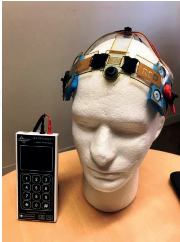
Figure 3. Example of transcranial direct current stimulator (tDCS) setup; mini-clinical trials (mini-CT) Unit, Soterix Medical ® .

only a subliminal neural hyperpolarization (under the cathode) or depolarization (under the anode), reducing/increasing in turns the responsiveness of the target neurons to the on-going afferent brain activity. Importantly, when combined with a second input, tDCS could results in powerful induction of LTP or LTD like phenomena. The mechanisms underlying this potential synergistic effect are not fully known, but they may rely on associative plasticity. It is known that task-specific training can induce task-specific neuronal changes based on use-dependent plasticity phenomena [20]. Therefore, the combination of behavioral tasks and tDCS may offer significant chances to achieve neuroplastic changes. The task-dependency of tDCS may influence the inter-individual variability of behavioral or neurophysiologic outcome observed after stimulation [21].