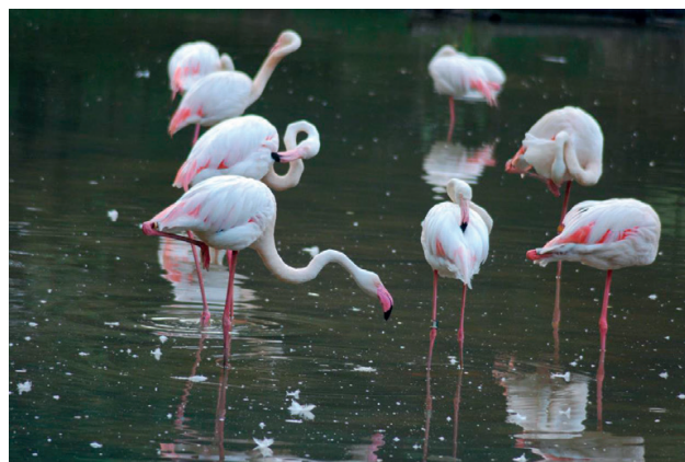
Figure 3. Greater flamingo— Phoenicopterus ruber . in the coastal area of Sindh, Pakistan.