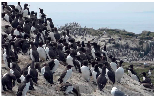
Figure 5. Common Murres— Uria aalge .