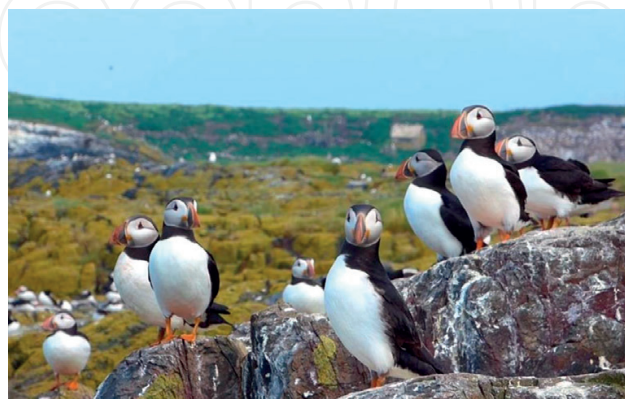
Figure 4. Atlantic puffin— Fratercula arctica .