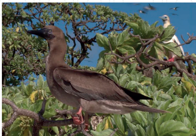
Figure 7. Red-footed Booby— Sula sula .