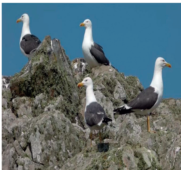
Figure 6. Great black-backed Gull— Larus marinus .