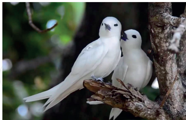
Figure 10. White tern— Gygis alba .