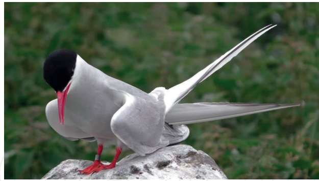
Figure 8. Arctic tern— Sterna paradisaea .