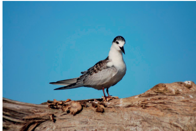
Figure 2. Whiskered tern— Chidonias hybrid . in Marudu Bay coastal area Malaysia.

and cormorants during winter season to forage in rich up dwelling areas. In addition, an island within the proximity to rich foraging sites also provide ideal nesting sites for Gulls, Guillemots, Cormorants, and Oystercatchers (Figures 4–10).