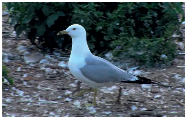
Figure 9. Ringed-billed Gul— Larus delawarensis .