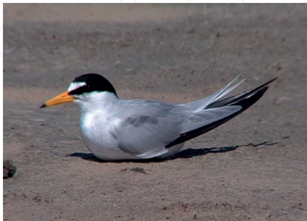
Figure 1. Least tern— Sternula antillarum .

The coastal and island areas offer heterogeneous habitat and highly productive foraging sites that had attracted a wide array of seabirds to forage year-round in these areas to fulfill their requirements ( Figures 1–3 ). These areas attracted congregate numbers of loons, gulls,