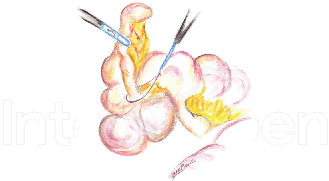
Figure 3. Tying up of the appendicular base.

closure. Numerous comparative studies have been published about these two approaches. Those in favour of the use of a stapler underline such advantages of this technique as the possibility of using it even in complicated appendicitis, reduction of the operating time and of the formation of endo-abdominal abscesses and a fast post-operation canalization of faeces