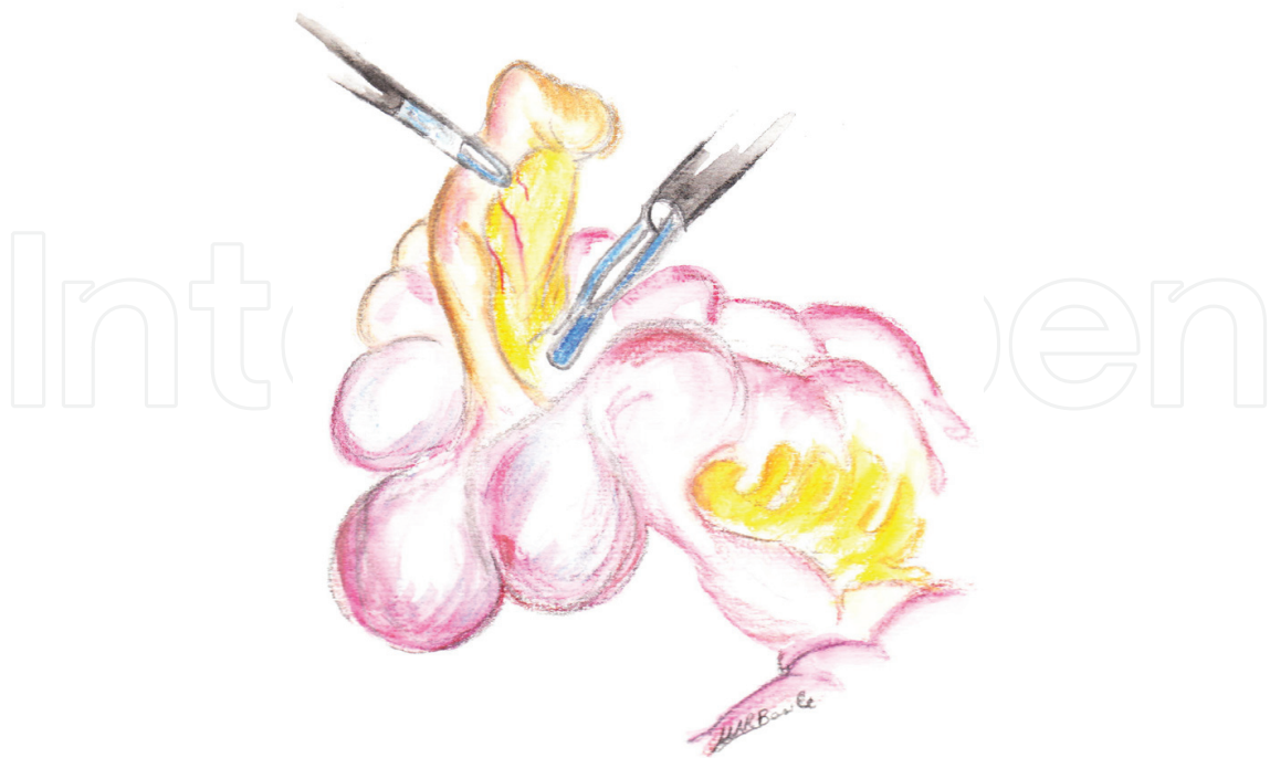
Figure 2. Coagulation and section of the meso-appendix.