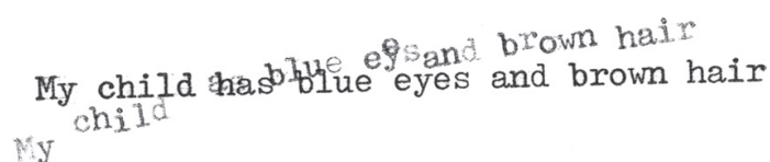
Figure 1. This is to imagine how a patient, having macular pathology, sees.

Squint surgery in childhood previous to the age of 3–4 years is a precondition for the establishment of certain imperfect cooperation between both eyes, a sort of anomalous fusion. Such