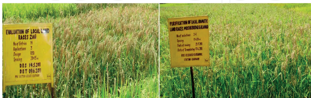
Figure 6. Evaluation, purification and selection of best genotype from Zag , Mushk budji and Kamad at MRCFC, Khudwani.

As discussed earlier, a fruitful outcome of germplasm characterization was that some of the promising nutritive red rice types having colored pericarp were identified for evaluation, molecular intervention and biofortification. Preliminary evaluation of the 13 major red rice types viz., Zag , Kupwara Zag , Uri Zag , Mir Zag , Khuch , Mir Sagi and some other accessions (GS 51, GS 80, GS 83, GS 224, GS 268, GS 289, GS 484) was also completed for yield and agronomic traits (2011–2012). The biochemical and mineral contents (Iron & Zinc) of these landraces are being determined using modern techniques (Figures 5 and 6).