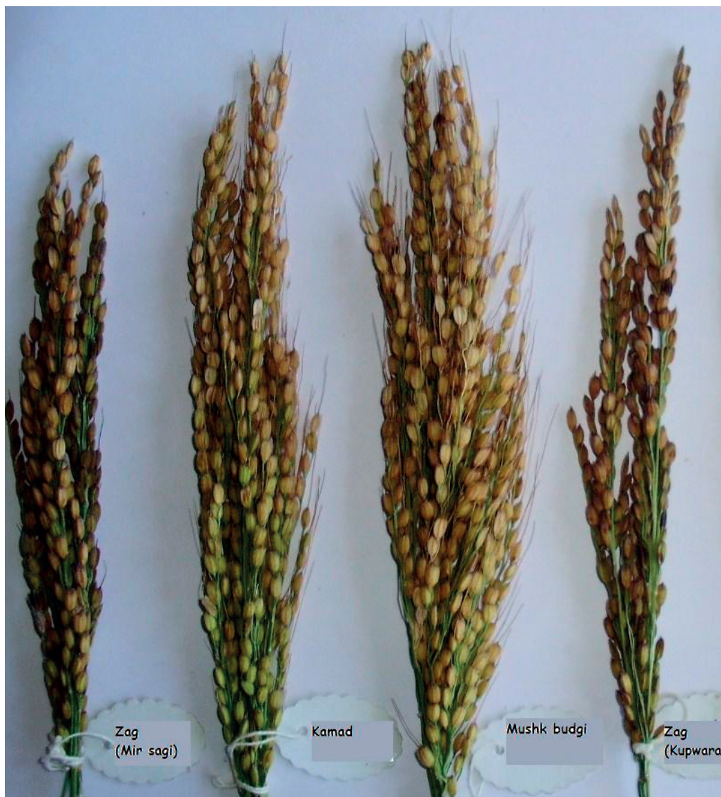
Figure 5. Popular landraces of rice in Kashmir (central two are scented, and outer two are red rice types).

made by the IRRI's standard evaluation system of rice on 0–9 scale. The promising test entries with tolerance to blast can increase prospects of producing rice organically.