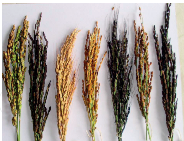
Figure 2. Local biodiversity of rice as depicted by the difference of panicle type, grain type, grain color, awn type etc.

Srinagar during the times of Maharajas, which could only be afforded by the affluent and rich families owing to their 4–5 times higher market price. These landraces are highly valued even in present times and are served to distinguished visitors and dignitaries. Some red rice types called ‘Zag’ are used for the preparation of snacks like ‘Vazul bate’ for pregnant ladies owing to their higher nutritive value, while some are preferred for preparation of munchies like ‘Bate laaye’, ‘Mur-murei’ and ‘Chewrei’. The varieties’ names in the local language often reflect the rice’s appearance ( Kaw kreer , Laer beoul , Nika katwor , Shala kew ), smell ( Mushk budji , Mushkandi ), color ( Zag , Safed Khuch , Bari safed , Kaw kreer , Khuch , Sig safed , Safeed braz , Safed cheena ), cultivator’s name ( Aziz beoul , Begum , Qadir baig , Rehman bhatti , Noormiree ), etc. Many varieties are characterized by a very specific taste, and their seeds are exchanged among neighbors/relatives, or are gifted for eating purposes in the form of roasted rice, locally called ‘ Bayel tamul ’. The long-grained basmati type varieties are cooked as ‘ Kashmiri pulao ’ and served along with dry fruit and raisins in the famous Kashmiri cuisine locally called as ‘ Wazwan ’. The loss of biodiversity therefore would also imply a fading rural culture ( Figure 3 ).