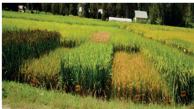
Figure 1. Biodiversity of rice, as depicted through a range in morphological variability.