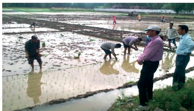
Figure 7. Participatory varietal selection (PVS) could be a good strategy for evaluation, dispersion and distribution of local landraces.