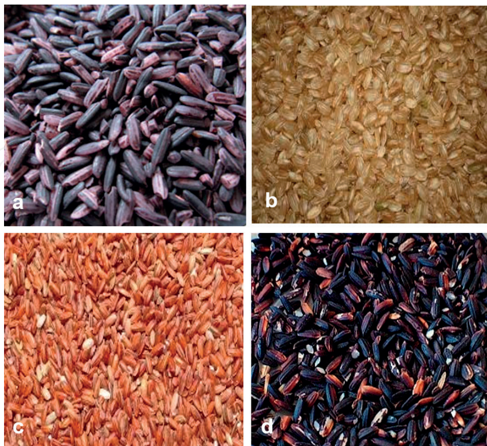
Figure 4. Pigmented rice types (a) Purple rice (b) Niver (c) Zag (d) Zager