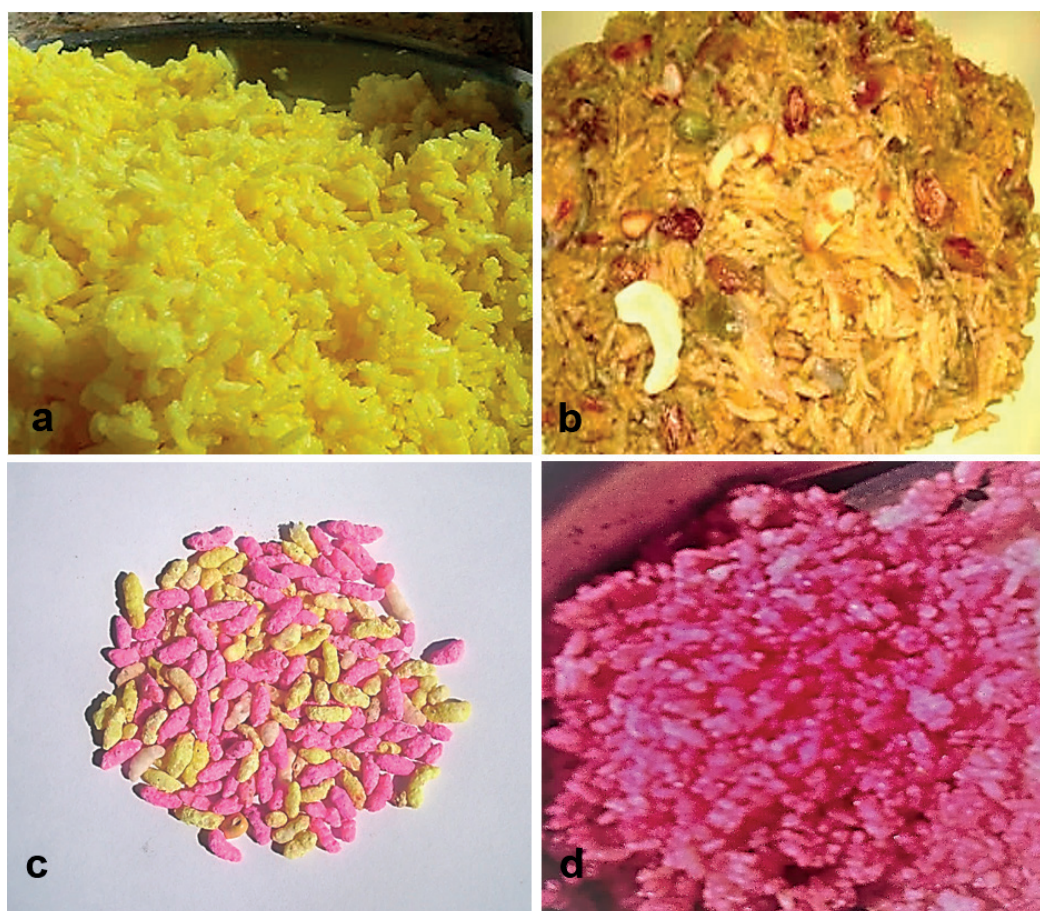
Figure 3. Agricultural biodiversity shapes food culture (a) Kashmiri salted rice Taeher , generally served at Sufi dargahs (b) Sweet Kashmiri pulao served with Wazwan (c) Bate laaye sold by local vendors as snacks for children (d) Cooked pigmented rice by a Gujjar family.

digestion can cause a sensation of hunger shortly after the ingestion of waxy rice and is considered unfavorable because its long term consumption can induce type II diabetes (i.e. non-insulin dependent diabetes) in adults. There is a prompt and pronounced increase of the blood glucose level (= high glycemic index) after the ingestion of rice (especially waxy rice), similar to that caused by white bread or pure glucose. Therefore in some parts of Jammu & Kashmir such waxy varieties are used for the preparation of sweet/salty snacks ( Meethay chaval , Taeher ) by cooking them and then cooling before consumption. Some varieties are preferred for the preparation of bread ( Tomul tschot ). Cooling after cooking has been shown to substantially slow down starch digestion due to physiochemical changes in the starch structure (retrogradation) [8]. Besides starch composition many other factors specific to these varieties viz., physiochemical starch structure or the size of the starch granules, also contribute to delayed starch digestion.