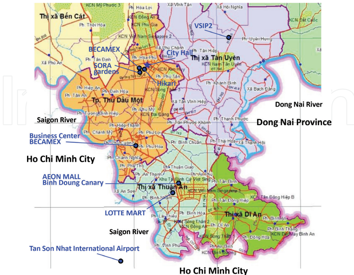
Figure 2. Facilities of Binh Duong Province. Source. Created from the HP material of Binh Duong Province.

new government center and administrative center, visiting officials at the administrative center, and commuting local residents.