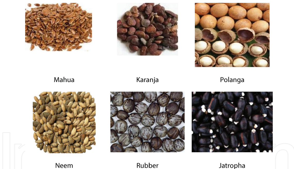
Figure 2. Seeds of six different species of non-edible vegetable oils as renewable sources for biodiesel.