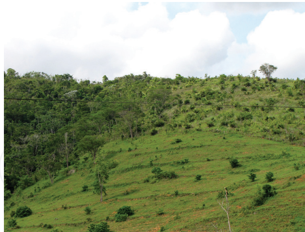
Figure 2. Extracts with different regeneration potentials; in the upper part of the slope (A), only the enrichment with planting of seedlings in nuclei in the regeneration faults was indicated; in the lower part of the slope (B), the planting in smaller spacing, always maintaining the regenerants, was pointed.

installed at intervals of 20–50 m, birds can move and disperse fruit seeds that they used in forest fragments still existing in the landscape. With the installation of perches in the reforestation, larger spacings can be adopted inasmuch as nuclei of natural regeneration tend to be formed around the perches.