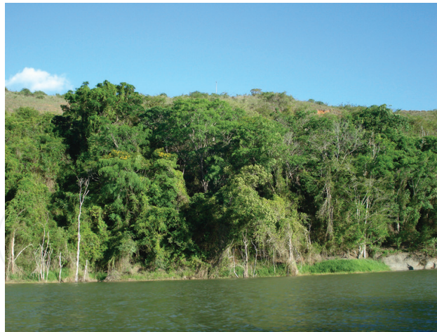
Figure 3. Restored ciliary forest by means of natural regeneration. Forest restoration project LARF-UFV.

As regeneration depends on three basic ecological mechanisms—seed rain, soil seed bank, and regrowth of vines and roots—in very anthropic landscapes, with a long history of intensive use only for agriculture or livestock and with forest remnants absent or very isolated and degraded, this process may not occur or be extremely slow.