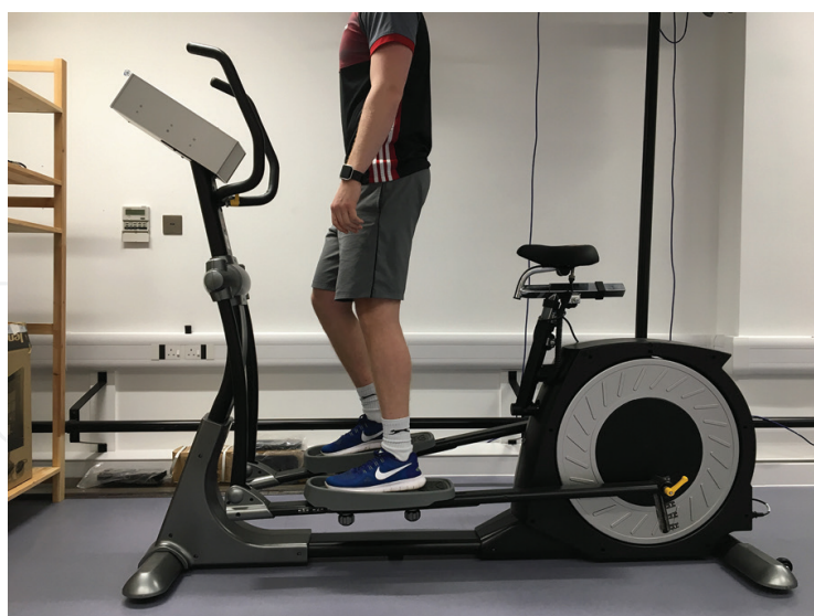
Figure 3. Current prototype of the functional readaptive exercise device.

to recruit them differentially [53]. More recently, FRED exercise has been shown to promote tonic activity of LM, assessed through measurement of superficial muscle activity using surface electromyography [58], as well as the deep lumbopelvic muscles using intramuscular electromyography [59], which is considered the most rigorous way of investigating muscle activity [60]. FRED exercise was shown to result in more selective activation of the LM and TrA muscles than over-ground walking [59], and it was found to reduce lumbopelvic movement when compared to over-ground walking, especially axial rotation of the spine [61]. To date, these studies are all based on normal terrestrial gravity, and the next step will be a clinical trial of the FRED following bed rest as a simulation of space flight. A musculoskeletal modelling study that examined the potential role of the FRED in the recruitment of lumbopelvic muscles in both +1 and 0 Gz environments, Lindenroth et al. [62] predicted that FRED exercise is able to facilitate lumbopelvic muscle recruitment in microgravity similar to how it recruits the same muscles in Earth gravity.