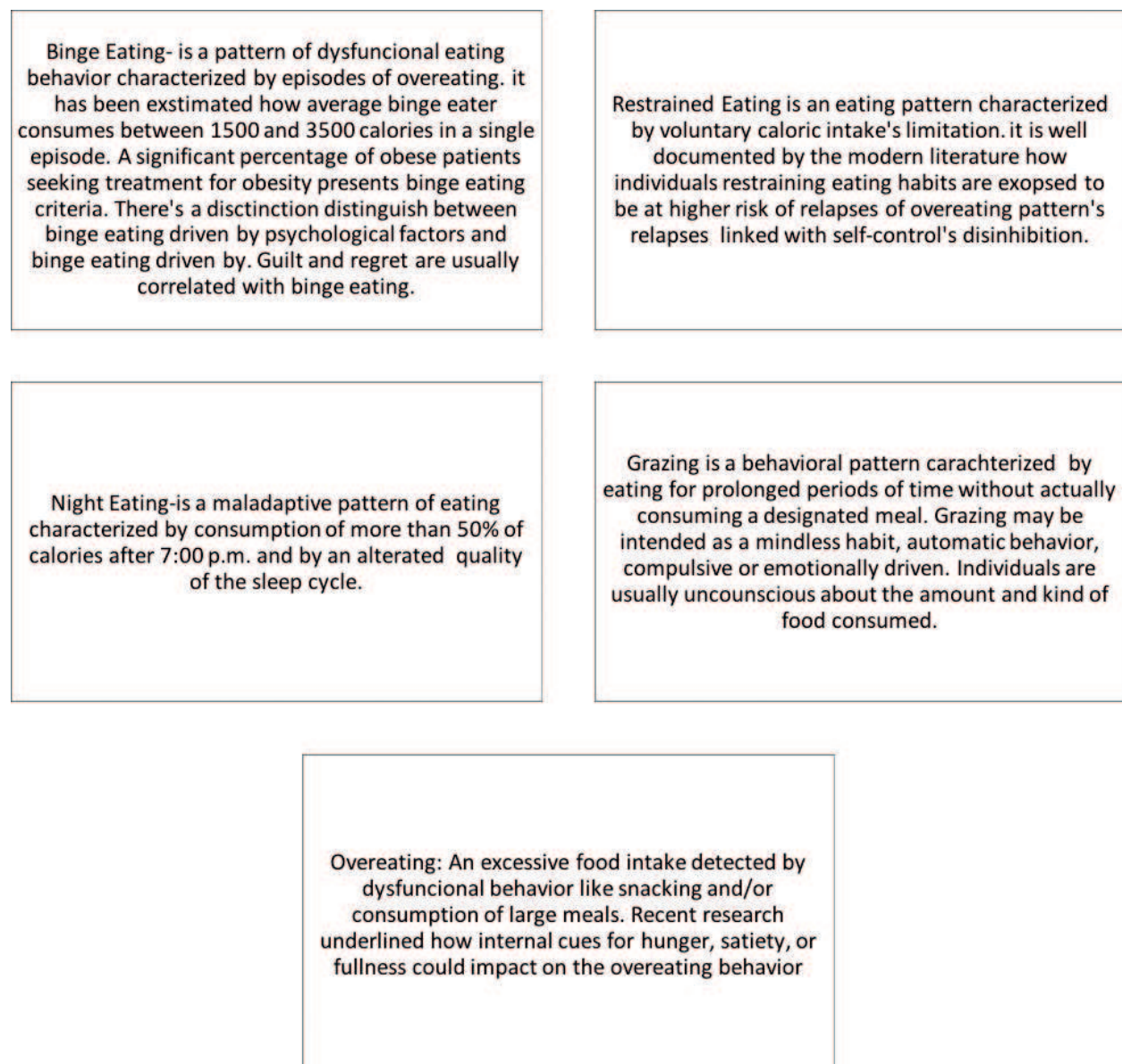
Figure 2. Dysfunctional eating behaviors.

Scientific literature is full of examples about how interventions exclusively aimed at weight loss results in bankruptcy over time, with a regaining of the weight lost during hospitalization within 3 years [5, 6]. It becomes clear that the multifactorial nature of this pathology requires multidisciplinary interventions, able to combine the different needs and urges of each individual, from a clinical, psychological, and social perspective. Psychological factors, in particular, influence both weight loss and, more importantly, long-term weight loss maintenance. Cognitive-behavioral