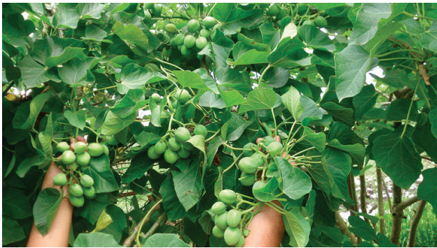
Figure 1. Jatropha curcas L.

The oil can be converted to biodiesel through transesterification easily [1]. Utilization is associated with the biomass that is left behind after the oil extraction. Large number of waste impacts the environment. In this chapter, we present several ways of processing the waste to make it a valuable product.