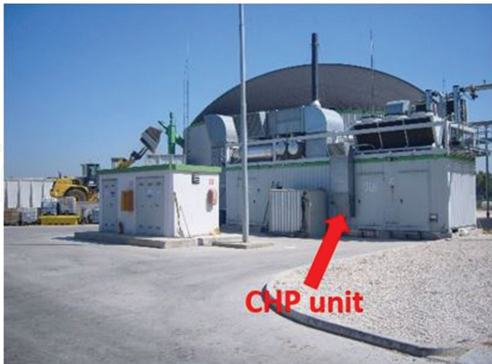
Figure 4. Combined heat and power unit (indoor place)