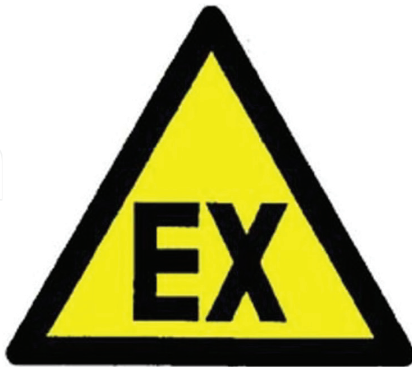
Figure 1. Sign (zone where potentially explosive atmospheres can occur).

(continuous, primary, secondary) is determined by the analysis of element operating conditions [28]. On the contrary, ventilation degree depends on the volume of explosive atmosphere, which is strongly influenced by biogas mass flow. This last parameter depends on gas outflow typology (sonic or subsonic), which is determined by the comparison between critical pressure ( p_{cr} ) and atmospheric pressure ( p_a ):