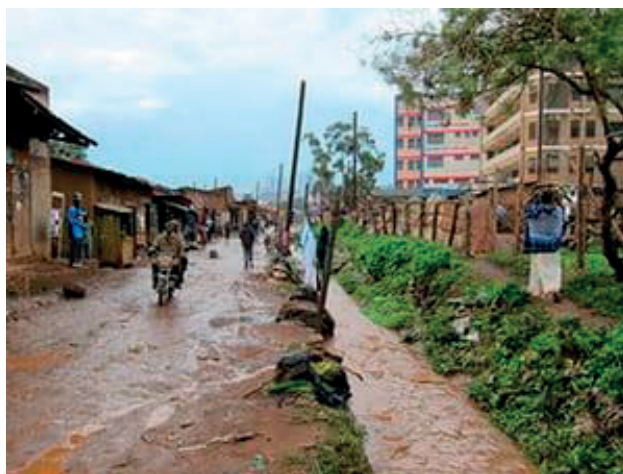
Figure 2. Some of the challenges of urban sprawl in Kampala. Source: [86].

Figure 1 summarises the various forces or factors which, according to key informants, explained Kampala's urbanisation between 1990 and 2013. The percentage distribution suggests that each informant suggested more than one form of factor. A comparative analysis of proportions reveals that with the exception of natural population increase, each form of factor/forces was identified by at least 50% of these respondents. This indicates that most of the key informants revealed similar factors. Specifically, all key informants (100%) indicated Kampala's urbanisation was due to its attractiveness to jobseekers and job makers. In addition, majority of these respondents (95.8%) identified government's modernisation agenda