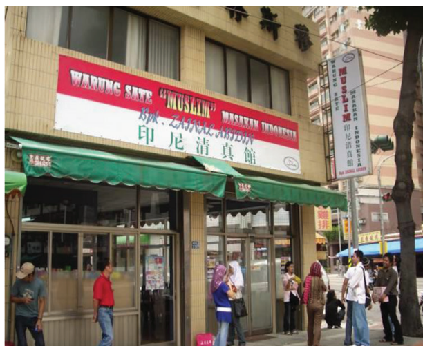
Specialist halal food/restaurant

From many restrictions on foreign worker access to urban space in Taiwan, the initial assessment might be that foreign workers have little chance of realizing their quest for associational life in the city. In attempting to engage in social life, the plight of foreign workers begins at the point of employment. Cheap and disposable, foreign workers are subject to the overarching