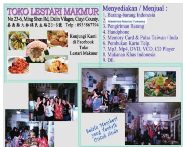
One-stop shopping and relaxation