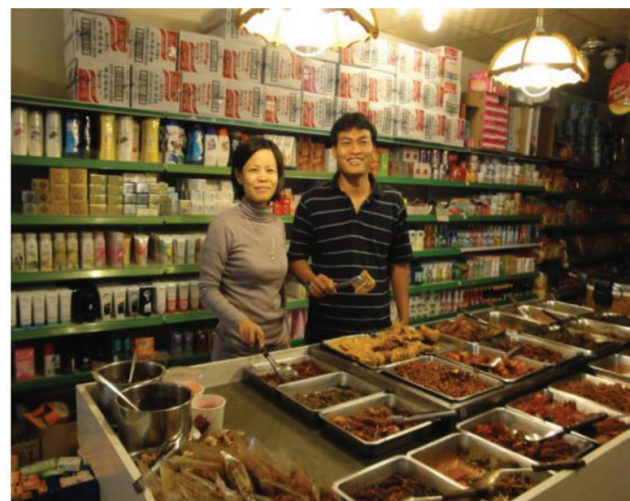
Grocery and restaurant