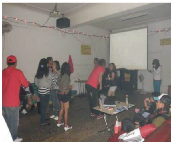
'Dangdutan' karaoke room