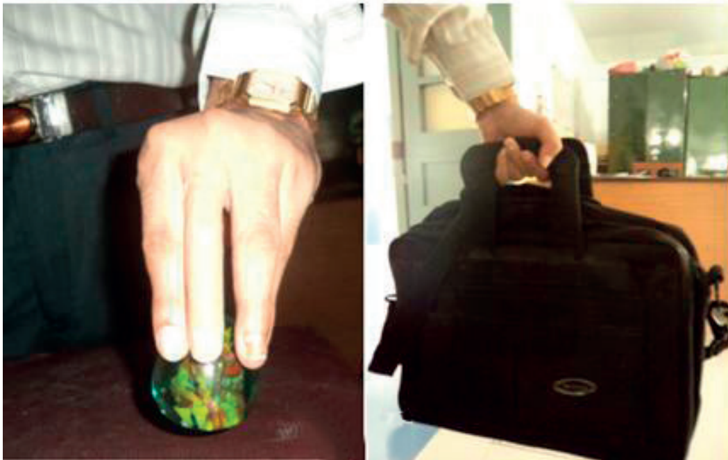
Figure 13. Patient with middle finger silicone prosthesis doing ADL.