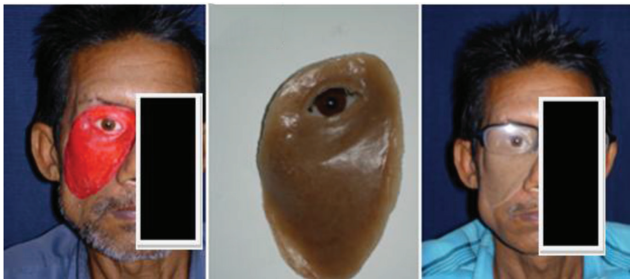
Figure 8. Patient with cosmetic eye.