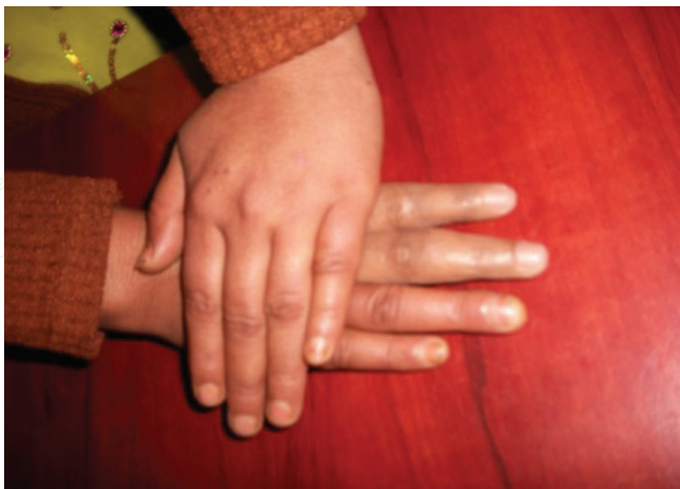
Figure 1. After fitment of silicone finger prosthesis in right side middle and index finger amputation.

The aesthetic hand prosthesis is previously used for cosmetic purposes, but the functional aspect has not been considered [4]. But role of this prosthesis is found in both cosmesis and passive functions ( Figure 2 ). The usefulness of aesthetic prostheses is confirmed by the improvement of patients' living conditions and the continued wearing of these prostheses by the patients. Although a variety of materials have been used for aesthetic restoration, silicone is generally preferred because of its versatility, durability and compatibility with human tissue. Polymers of dimethyl siloxane (silicones) allow copying of the natural hand in every detail. Silicone prostheses are usually of high quality, match well with the patients remaining digits and thus are more aesthetically pleasing; long-term wearing of this prosthesis confirms as therapeutic tools. To achieve the normal appearance in the prosthesis, the cosmetic nail, the hair and flocking are used.