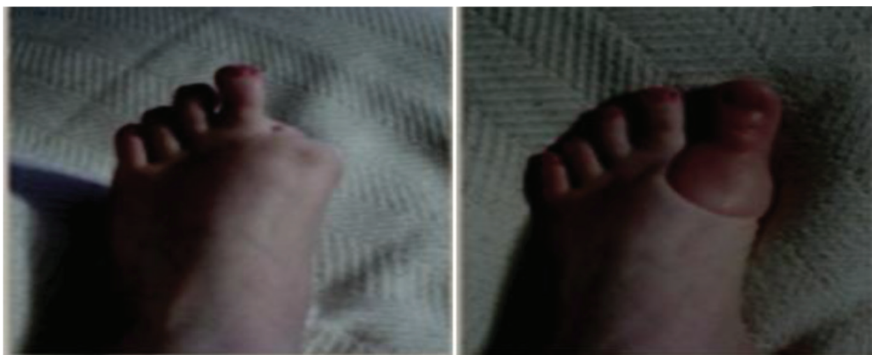
Figure 3. Before and after fitment of silicone toe.

The cosmetic prosthesis of the finger and hand is not usually having the movable digits. The prosthesis is only used for the cosmesis purpose and psychological benefit for the patients. Now these prostheses are having some passive movements of the fingers due to the involvement of some copper wires inside the prosthesis during the time of fabrication. This process is cost-effective and time-saving [6] ( Figure 6 ).