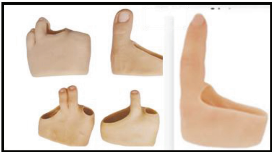
Figure 7. The finger and toes with strap suspension.

The face is considered as the most beautiful and expressive part of the body. The eye, ear, chick and nose, play different roles in various expressions ( Figures 8–11 ). If the patient lost any part of the organ in the face, they felt as a half-dead person. These kinds of people were not having the courage to face the society. In the process of plastic surgery, they may modify the structure but