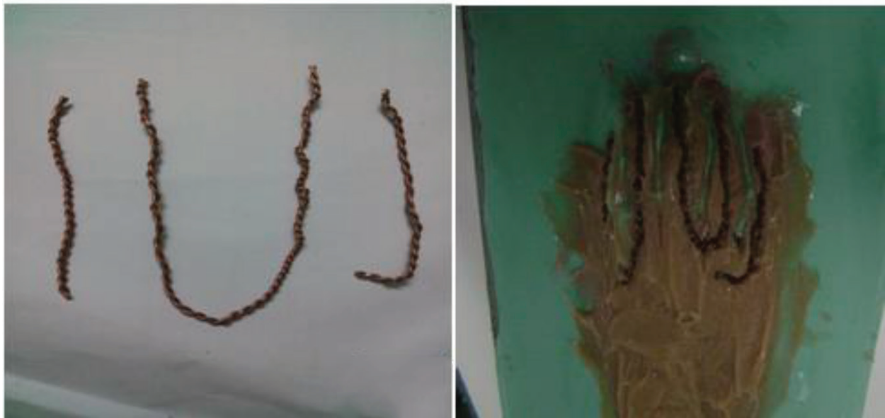
Figure 6. Copper wire and silicone die of partial hand with copper wire.