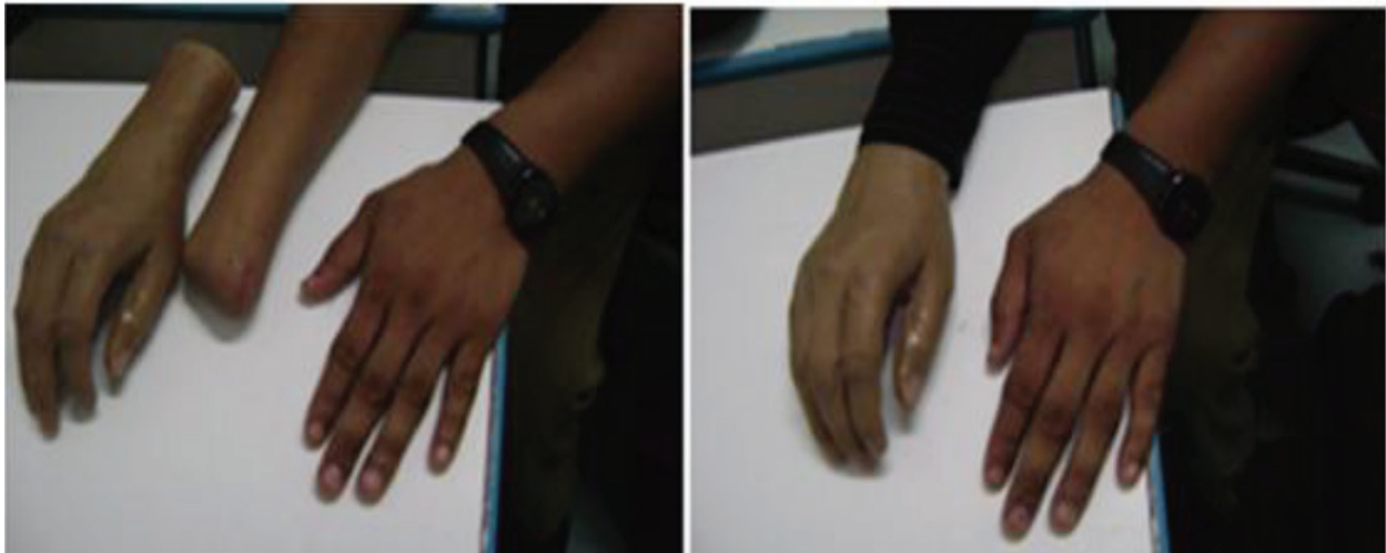
Figure 2. Partial silicone hand prosthesis.

Apart from the finger and hand, toe and partial foot silicone prosthesis is mostly accepted by the patients [5] ( Figures 3, 5 ). The cosmetic prosthesis mimics the natural appearance without any complicated mechanism. These are easy to use with very low maintenance. So, nowadays, the use of cosmetic prosthesis is more than a complicated functional prosthesis.