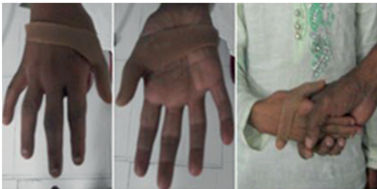
Figure 14. Cosmetic finger with strap suspension.