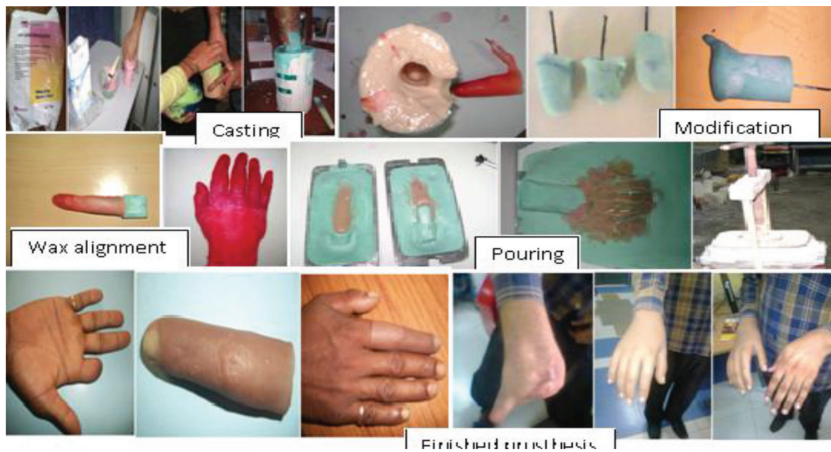
Figure 12. Procedure for fabrication of finger and hand prosthesis.

The male of 35 years old reported to the clinic having one middle finger amputation of the LT hand. He is professionally an engineer, and the chief complaint was that he had lost his support during the activities like feeding. The stump was good to fit the cosmetic silicone prosthesis with passive function. The copper wire was inserted inside the silicone mixture during the pouring process for the passive movement of the prosthesis. After the fitment of the prosthesis, he can be able to hold the bottle, got support to write and found improvement in activities of daily living ( Figure 13 ).