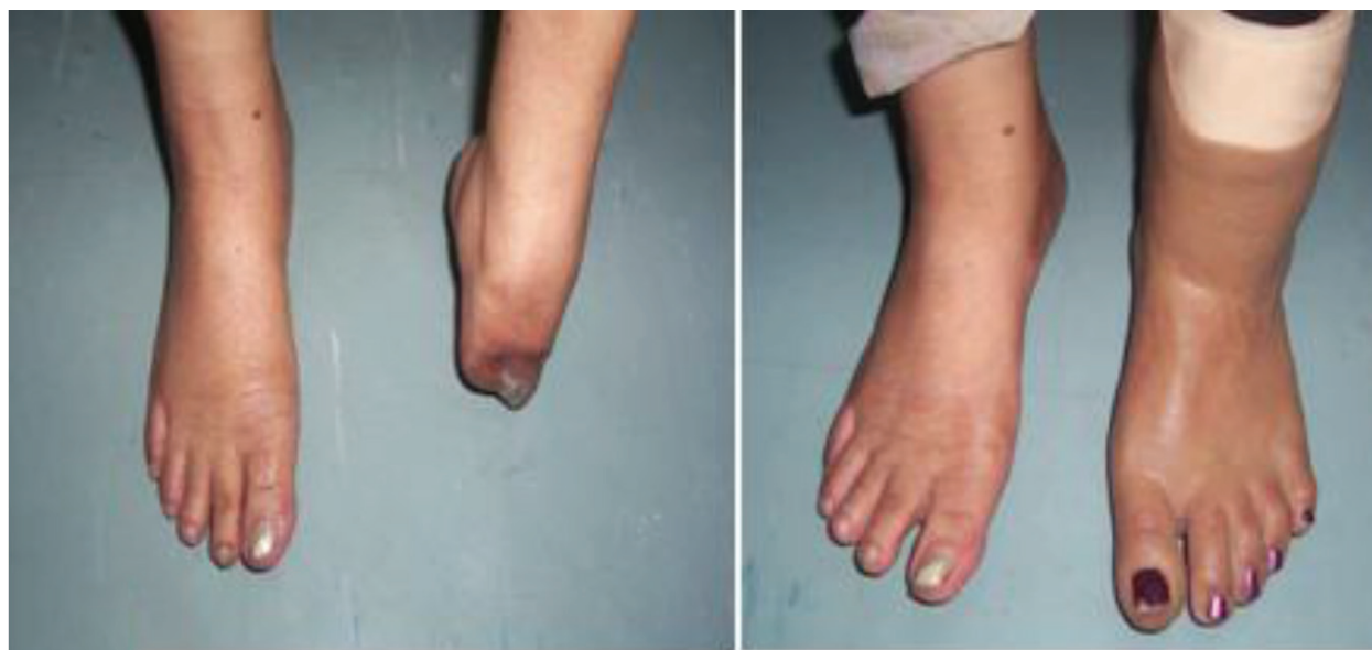
Figure 5. Silicone partial foot prosthesis.

The attachment of prosthesis depends upon the remaining part and contours of the stump. The finger amputation of PIP and DIP level, the suction suspension is the method of attachment, and amputation through metacarpophalangeal attachment is through strap suspension ( Figure 7 ). The alignment is done before the fabrication during this process, and the overall length is checked with the opposite limb.