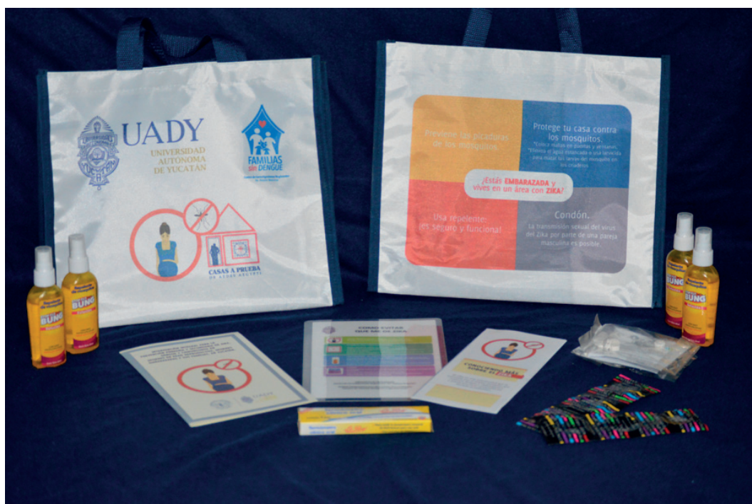
Figure 5. Prevention kits for pregnant women.

It is directed to the pregnant women who participate in the project and the women who are at reproductive age within the family nuclei. Workshops are also held with their partners so that