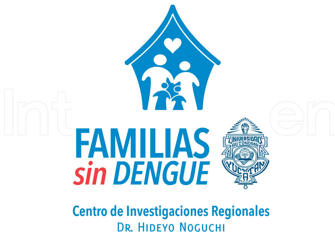
Figure 1. Identification logo of the project families without dengue.

ZIKV infection in the general population presents with a mild disease that remit in 3–7 days. ABD are endemic in Yucatan, and congenital infections result from the transmission of