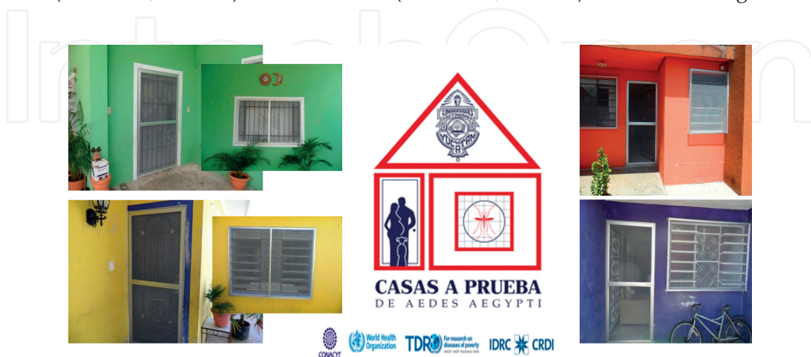
Figure 6. Aedes aegypti -proof houses.

The selection of these interventions was based on previous studies of our group. Briefly, from 2009 to 2014, cluster randomized controlled trials were conducted in the Mexican cities of Acapulco and Merida. Intervention clusters received Aedes aegypti -proof houses with ITS and followed-up during 2 years. Overall, results showed significant and sustained reductions on adult vector densities in houses in the treated clusters with ITS after 2 years: ca. 50% on the presence (OR \leq 0.62 , P < 0.05 ) and abundance (IRR \leq 0.58 , P < 0.05 ) of indoor-resting adults. ITS