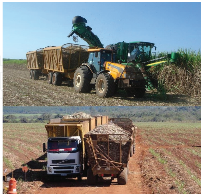
Figure 5. Transshipment to aid the transport of sugarcane from the plot to the truck or train.

Sugarcane has a great economic importance in Australia. According to Higgins and Davies [31], in this country, the sugarcane is mostly concentrated in the northeast, and the cut begins in the winter and goes until the end of spring, when the highest percentage of sucrose is concentrated.