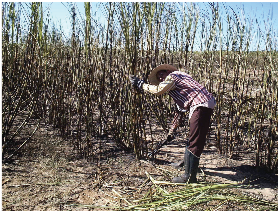
Figure 3. Hand sugarcane harvesting.