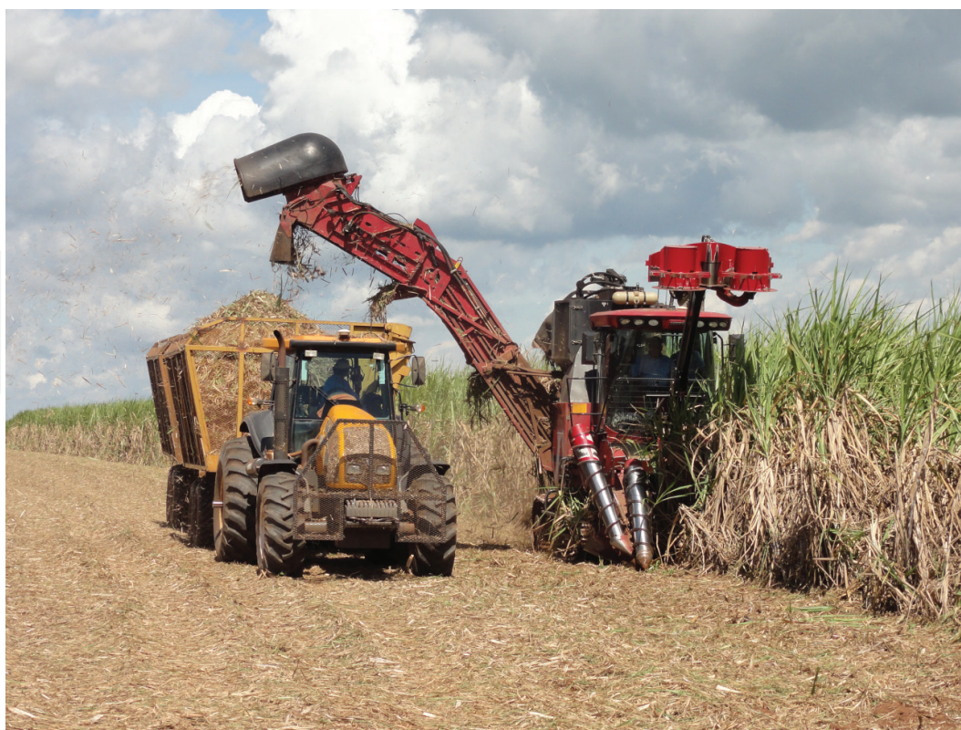
Figure 4. Sugarcane mechanized harvesting.