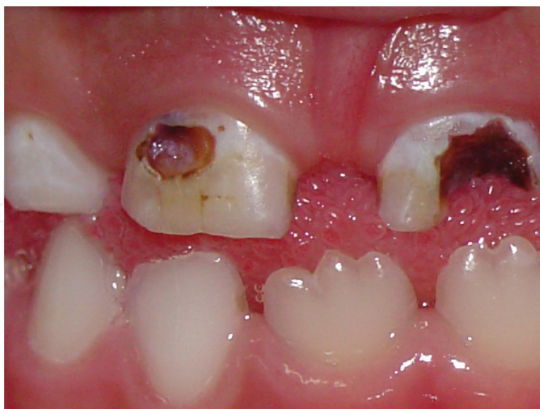
Figure 7. Severe buccal caries in upper incisors.