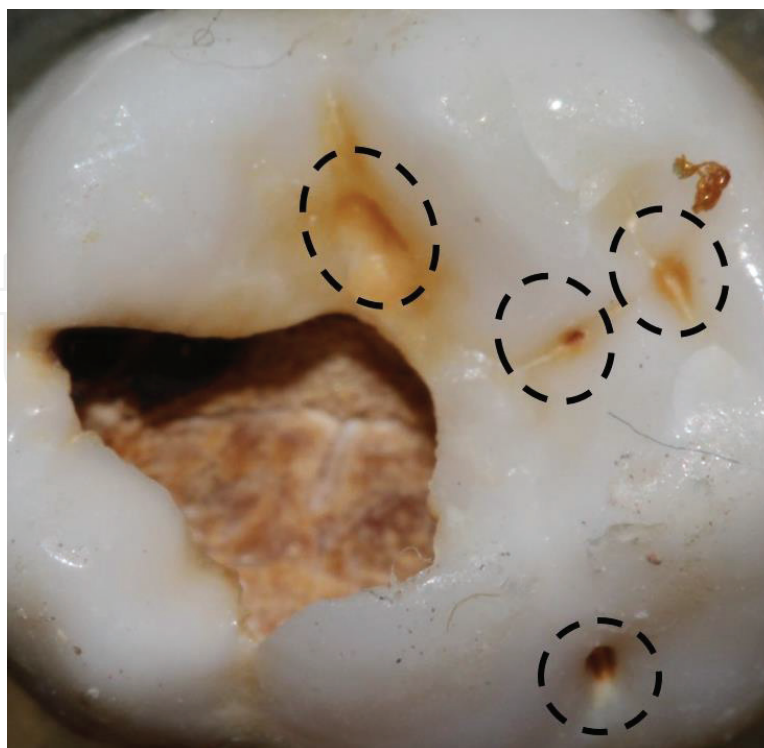
Figure 3. Tooth depressions are always anatomical points for dental caries.

Certain researchers use the term “groove-fossa system” ( Figure 4A ) when describing depressions in the occlusal part of a tooth that is vulnerable to dental caries [34]. This is of particular importance in Pedodontics for identifying risk areas for caries in deciduous teeth and first permanent molars. The pit formed by junction of developmental grooves is a very interesting anatomical feature in the molar occlusal surface; a very “tricky” area for dental caries on the occlusal surface.