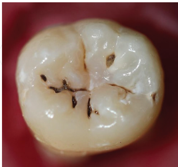
Figure 5. Occlusal caries.

Many dental professionals do not consider single tooth proximal surface dental morphology by itself as a predilection for caries. However, a recent study concluded that morphologies