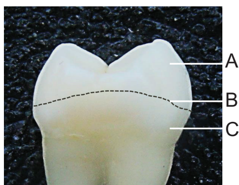
Figure 2. The equatorial line of a tooth. (A) Non-retentive area; (B) equatorial line; (C) retentive area.

The line that separates these areas is called the equatorial line. This is an imaginary line that can be drawn by circling the most convex surfaces of a tooth: the lingual, buccal, and proximal ( Figure 2 ).