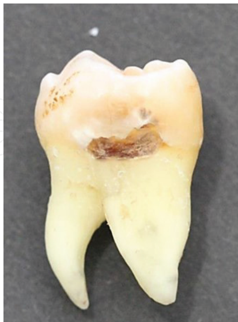
Figure 6. Interproximal caries below the contacting point.

For detection of proximal caries, and as adjuncts in the process, bitewing radiographs remain state-of-the-art. However, a good number of caries detected by radiographs (lesions extended to the outer dentine) can be intact on enamel surfaces [52]. Since carious lesions are directly dependent on the continuous presence of active microorganisms, a reasonable approach is to monitor caries using a series of bitewing radiographies [53] ( Figure 6 ).