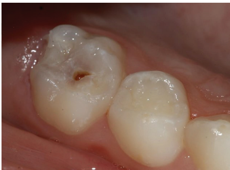
Figure 8. Dental caries developed during eruption process in second deciduous molar.

Dental disorders in hard tissues are seldom presented and discussed during classes teaching dental anatomy. Most instructors are concerned solely with teaching the normal morphology