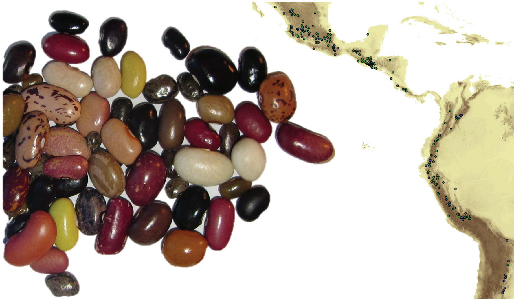
Figure 1. Geographic distribution of wild relatives (light gray) and landraces (dark gray) of common bean and its diversity in terms of seed size, colors, and patterns. Modified from Cortés et al. [12].