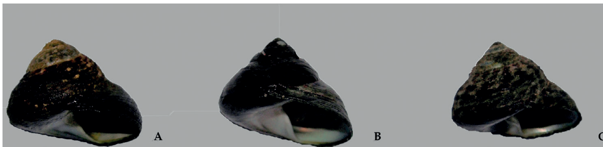
Figure 1. Shell phenotypic variability of Phorcus sauciatus . A – Portugal mainland, B – Madeira Island, C – Gran Canaria Island.

and papillate tentacles, cup-shaped open eyes on distinct stalks, a foot, a muscular ventral organ with a flattened base used for locomotion, and a visceral mass, which fills dorsally the spire of the shell and contains most organ systems and the mantle, a collar-like tegument, which lines and secretes the shell, and forms a mantle cavity normally provided with respiratory gills for breathing in water and a well-vascularised mantle cavity, which allows the animals to breathe in air [13, 14].