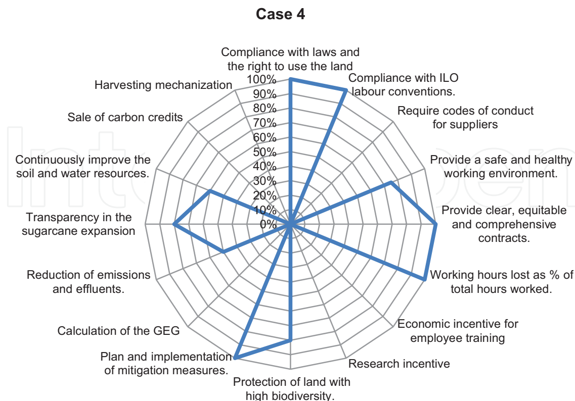
Figure 4. Attendance of Case 4 for each criterion of Bonsucro, in percentage.

The differences to be highlighted are the money set aside by mills to invest in employee training and research, which ranges from critical to acceptable; the percentage of hours lost at work; and the requirement of sugar mills to suppliers of codes of conduct, ranging from critical to ideal.