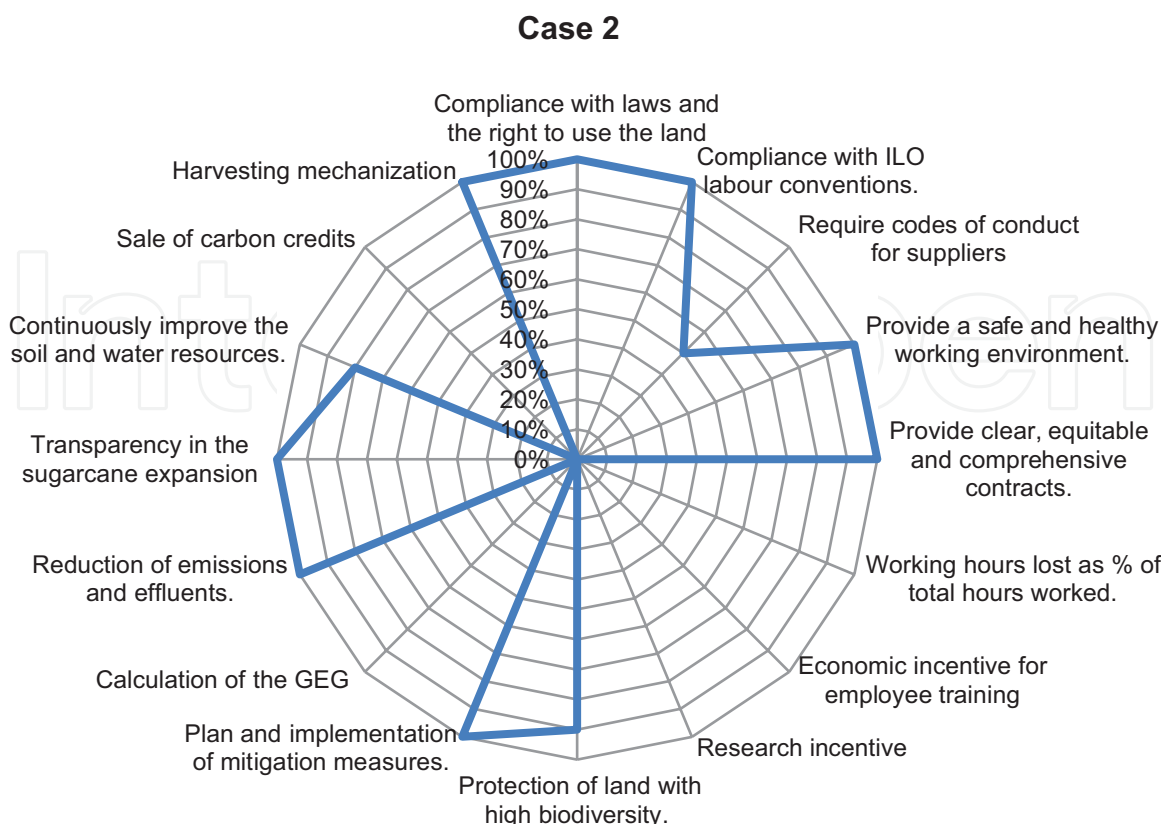
Figure 2. Attendance of Case 2 for each criterion of Bonsucro, in percentage.

The area of sugarcane harvested in 2012 was 24,835 ha. This was distributed in leased areas (31.2% of the total), outsourced areas (61.7%), and own area (7.1%). The average radius of the plantation at the plant is 17 km, smaller than the other cases.