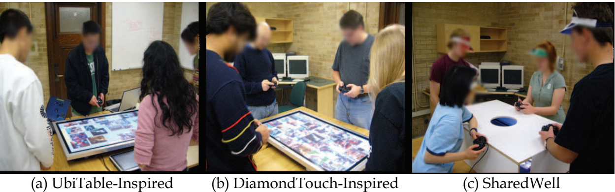
Fig. 5. Three digital setups.

Our study in digital setups involved observing six groups (four participants each) performing in the same setting. We carried out our observations using three digital tabletops inspired by existing systems. All experimental setups used a table of size 1261×1530 sq mm and a horizontal display of size 635×1030 sq mm. Users could stand comfortably in front of the table. To keep the total experiment time to a reasonable amount, we restricted the task to Task 1 of the real-world setup. Similar to Task 1, 40 images were used for each task. Participants were only allowed to change image locations; no other image manipulations were allowed. At the beginning of each session, the groups were given instructions indicating how to perform the task. Following the instructions, the participants had a three-minute practice session before beginning the experimental task on each setup. For each setup, the task duration was 15 minutes.