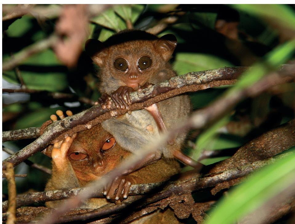
Figure 1. A tarsier infant (infant II) resting on a branch in contact with its mother.

Play : an infant was considered playing when the movement or the body posture was awkward, exaggerated or incomplete; or the speed, aiming or accuracy of the movements was relaxed (criteria consistent with the definition of play developed by Burghardt [21]). See below for more details (Video 1).