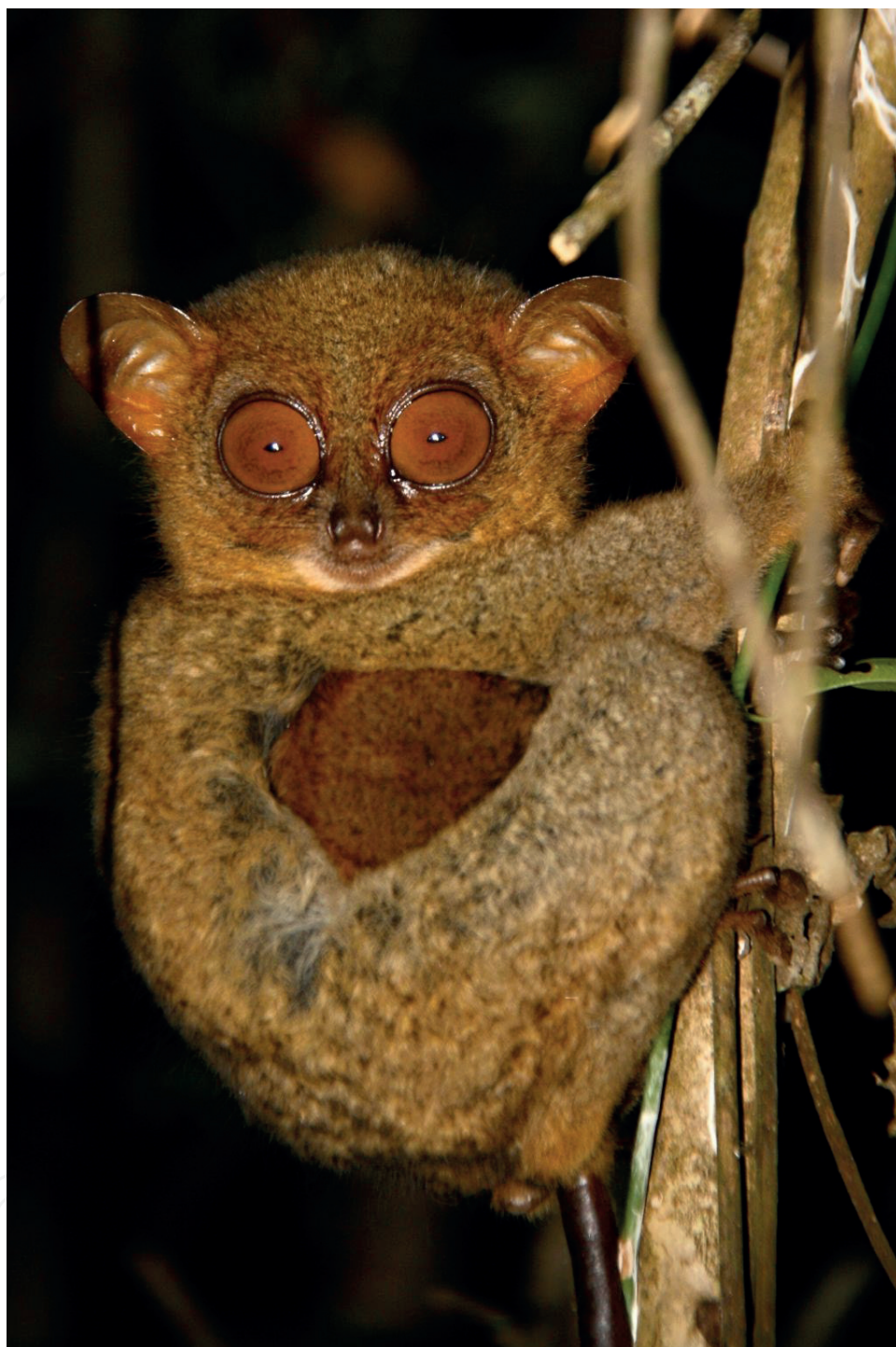
Figure 2. A tarsier infant (infant VIII) suckling.

Carried: an infant being carried by the mother and transported from one location to another ( Figure 3 ).