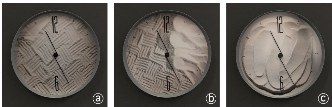
Figure 2. Static visualization. (a) Everyone in the team feels stressed. (b) Someone(s) feel stressed, someone(s) do not. (c) Everyone in the team does not feel stressed.

Static visualization ( Figure 2 ) is an ambient intervention, which is inspired by Zen garden. The sand traces changed imperceptibly slowly within a glance, so it appears to be static. When everyone in the team feels stressed ( Figure 2a ), the entire clock is covered by dense patterns, showing the even pressure of every team member. When someone(s) feels stressed, but someone(s) does not ( Figure 2b ), the sand traces appear to be bipolar: half of the clock is covered by dense traces, but half of it is not. The ratio of the two parts also displays the uneven loadings of workers. When everyone in the team does not feel stressed ( Figure 2c ), the sand traces are slowly erased, so it appears to be peaceful. With these trace patterns of the sand, the design also attempts to evoke inner peace, calmness, and tranquility of people.