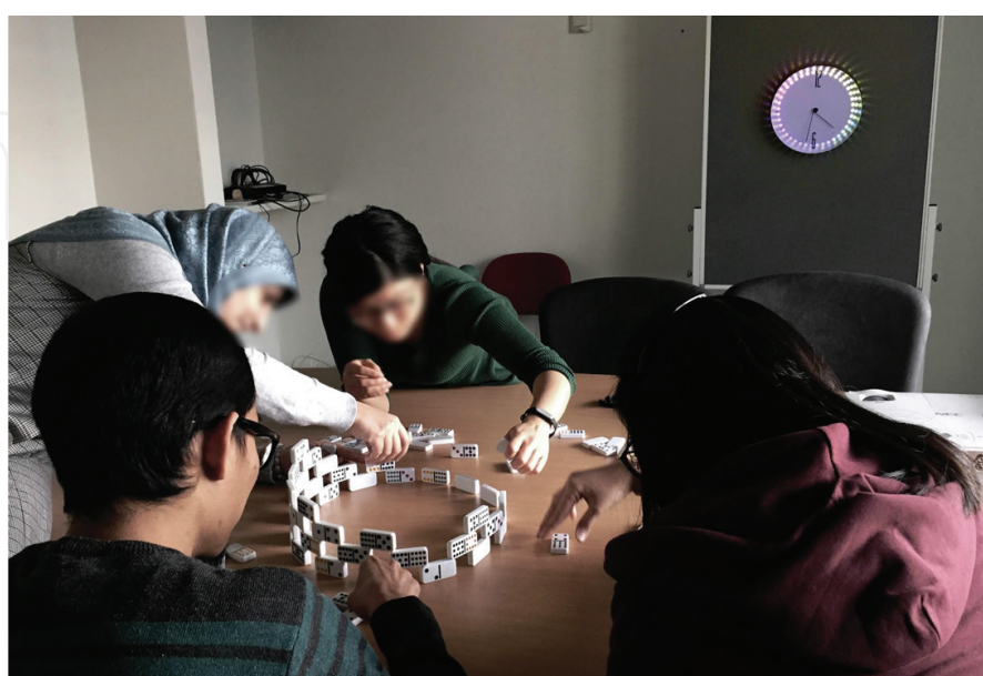
Figure 4. Experimental apparatus.

Each team was asked to finish each of the three tasks in 5 minutes. The tasks are designed in different difficulties. The first task is to collaborate with each other and make a 2D pattern that can be knocked down in one push. This refers to an easy task that associated with low-stress status. The second task is to collaborate with each other and make a 3D round tower,