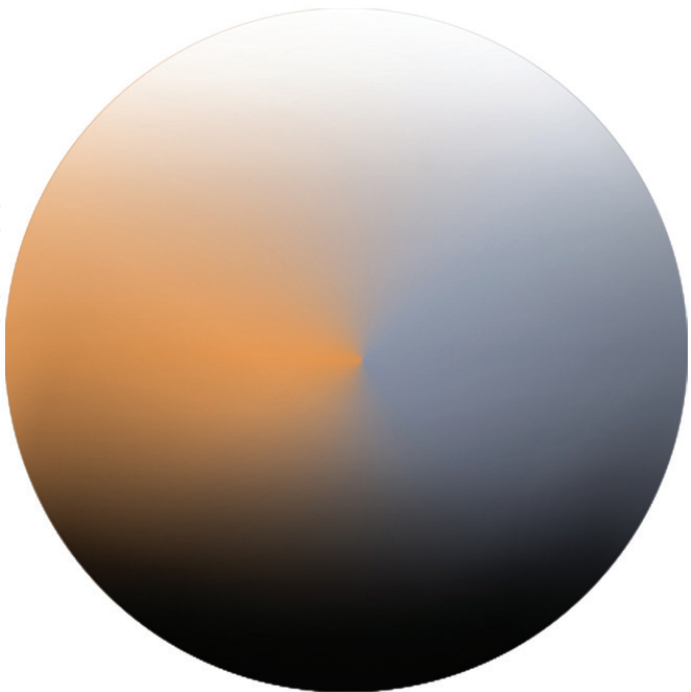
Figure 2. Graphic mapping of light color temperature (left to right, kelvins) and brightness (up and down, lumens).