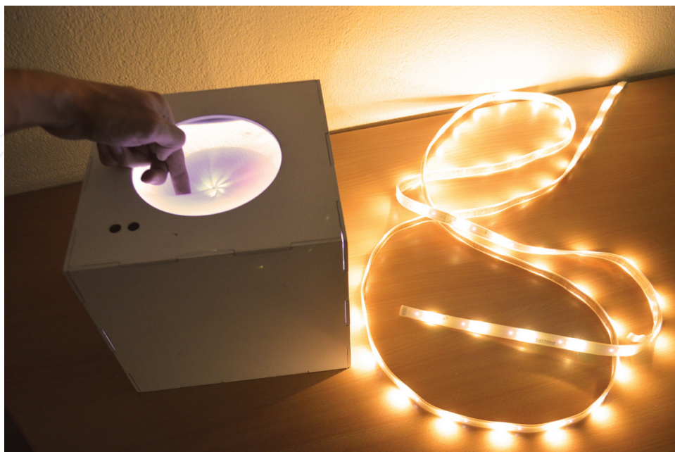
Figure 4. The Anthox with control plate sunk down inside, fabric twisted into a spiral. Compare legibility of control surface with that of Figure 1 .