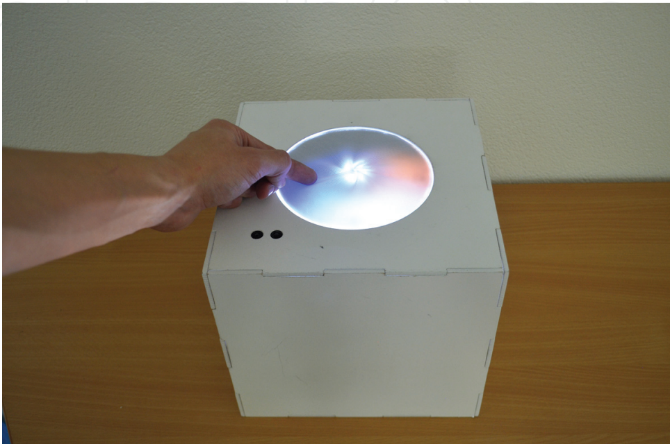
Figure 1. Anthox , a controller for an intelligent lighting system.

circular control surface consisting of a graphic mapping of light color temperature and brightness ( Figure 2 ). This control plate is translucent and backlit. The light enables the graphic to be read through the stretchy fabric mesh above it. Single-touch inputs are received on the control plate (through the fabric) as in Figure 1 . Users are given functional feedback through connected Philips Hue lights which change according to their inputs.