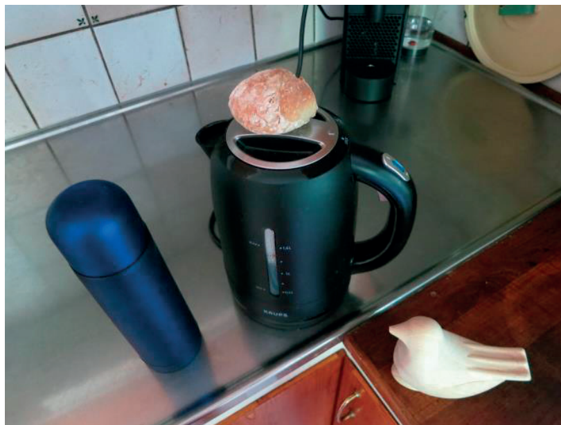
Figure 4. Household 3 used the heat of the coffeemaker to defreeze the bun instead of using the microwave.

Household 3 did not do any activities out of the ordinary "we are not going to build a sandbox" (this was one of the suggested alternatives for them as they expressed great engagement in their 1 year old granddaughter in their peace profile). Household 2 did many of the suggested alternative activities such as day dream, read that dusty book on the shelf, and cuddle. "We'll keep the concept of Peacetime" their mother said.