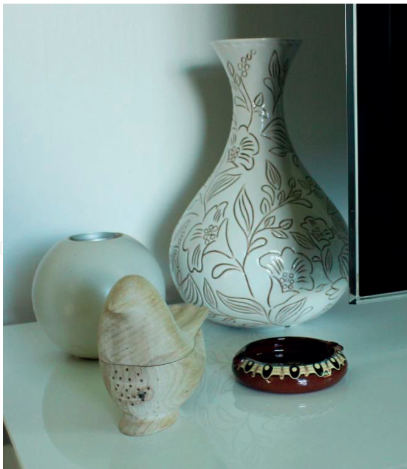
Figure 2. A chirping bird, in Household 2.

A prototype of the Peacetime concept was built and 2-week forecasts of Peacetime periods were created. Peace hours could start in the morning, in the afternoon, or multiple times throughout the day. Forecasts were accessible 3 days in advance on the Peacetime website. A switch was programmed to activate the stepping motor of the pinecone in the nest, according