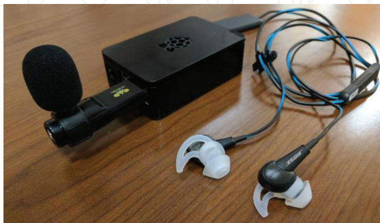
Figure 1. Depiction of design prototype.

The hardware portion of this device continuously completes the digital filtering task during the device’s operation. To do this, the Simulink code for the detector and filter has been uploaded onto a Raspberry Pi (Raspberry Pi Foundation, Cambridge, UK) to allow for alarm filtration. A microphone connected to the Raspberry Pi obtains and passes the environmental sound to the digital detector ( Figure 1 ).